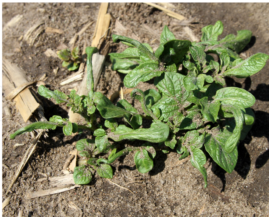
Figure 4. Plant symptoms from glyphosate-contaminated seed. Symptomology may be confused with those expected from drift of a plant growth regulator herbicide.