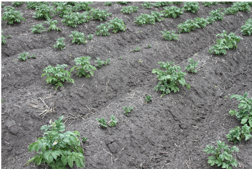
Figure 3. Erratic potato plant emergence pattern due to glyphosate-contaminated seed.

The first general observation of a potato field planted with glyphosate-contaminated seed is an erratic emergence pattern throughout the field. Being a seed-borne problem, a pattern in the field should not occur. Rather a scattering of plants with different rates of emergence should be observed (Figure 3). The erratic emergence pattern is found because tubers contain various amounts of glyphosate, and the higher the glyphosate level at the tuber eye, the slower the sprouts are to emerge from the soil. Plants with glyphosate residues will often express symptomology in new leaves through malformed leaves that appear to twist or bend in unnatural ways (Figure 4). Leaves have been noted to become chlorotic in some cases [38].