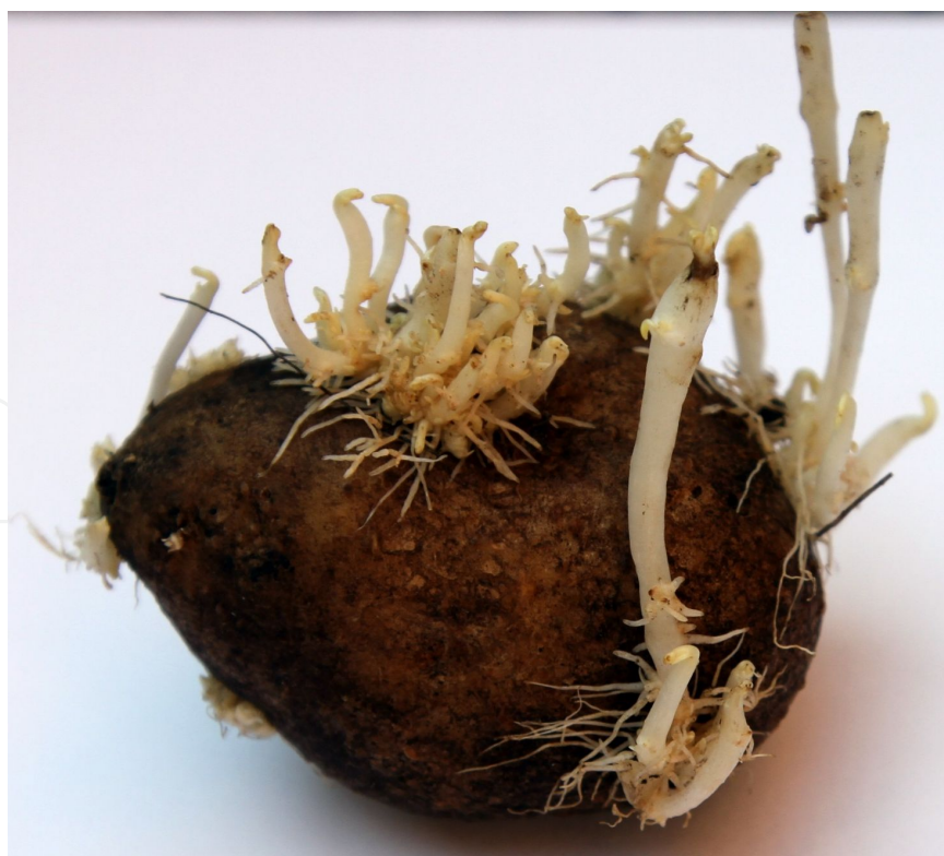
Figure 5. Multiple shoots emerging from a single eye of a glyphosate-contaminated tuber.