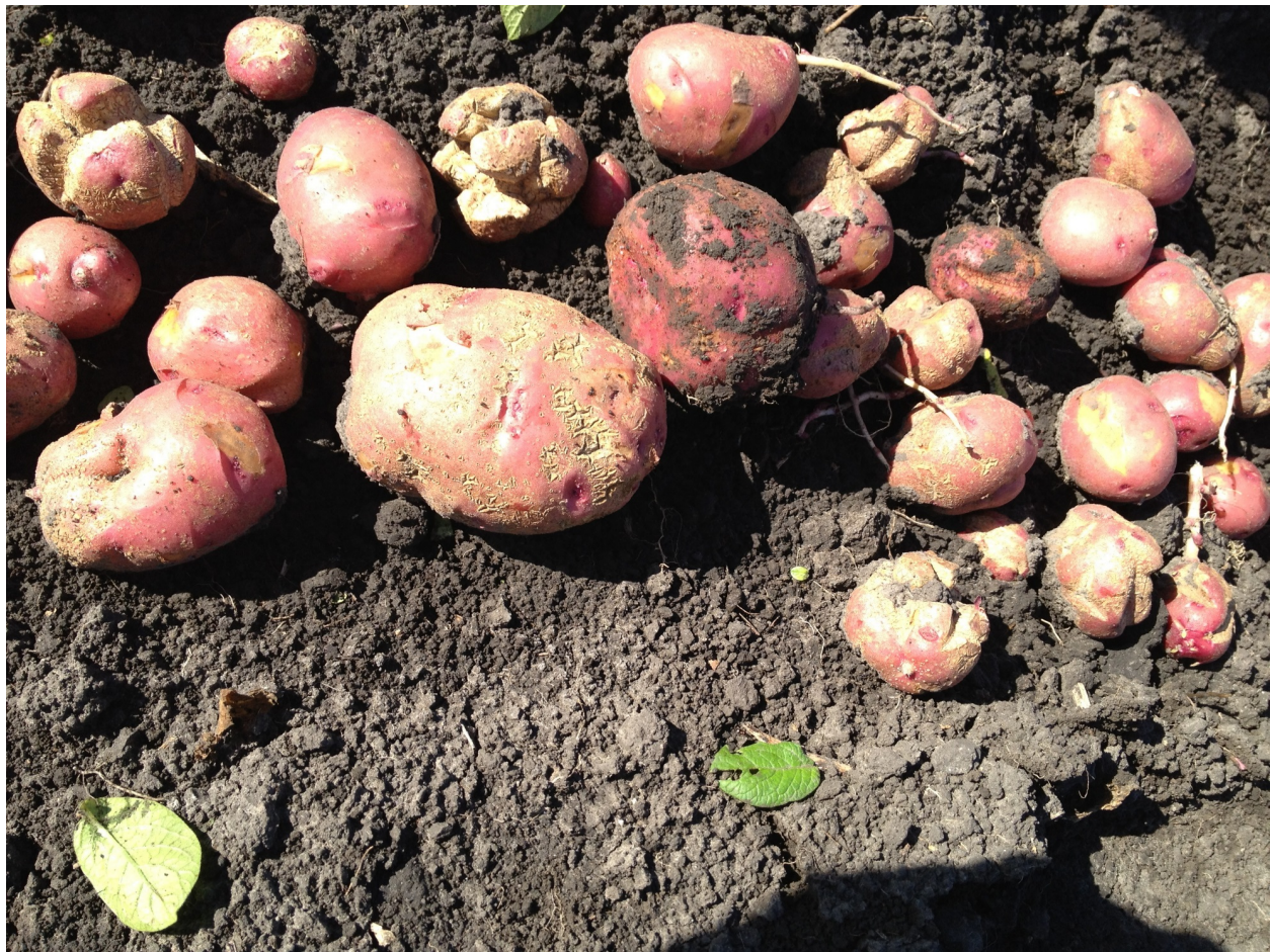
Figure 1. Tubers from two plants where glyphosate drift was suspected. Tuber symptoms are typical from glyphosate exposure during plant hooking or tuber initiation growth stages.

growth stage could alter this affect, a two-year field study treated “Russet Burbank” plants at four growth stages—hooking (H)(BBCH-scale 40), tuber initiation (TI)(BBCH-scale 41), early bulking (EB)(BBCH-scale 43), and late bulking (LB)(BBCH-scale 47)—to evaluate glyphosate injury to the current-season crop. Plants within each of the growth stages received a sublethal dose of glyphosate, which corresponded to one-fourth, one-eighth, one-sixteenth, or one-thirty-second the lowest recommended single application rate for glyphosate at 846 g ha -1 . Plants at the H stage were an exception with only one sublethal dose (215 g ha -1 ) applied at this stage. The last treatment of this 14-treatment trial, arranged as a randomized complete block with four replicates, was the nontreated check, which consisted of spraying the plants with a water plus ammonium sulfate solution. The middle two rows of each plot were harvested and graded in October. Data were subjected to analysis of variance (ANOVA) using PROC GLM (SAS version 9.2, SAS Institute Inc., Cary, NC) and, where appropriate, Fisher’s protected least significant difference (LSD) tests, at a probability level of \leq 0.05 , were used for mean separation. Data could not be pooled across years for all yield and grade data and thus were analyzed separately.