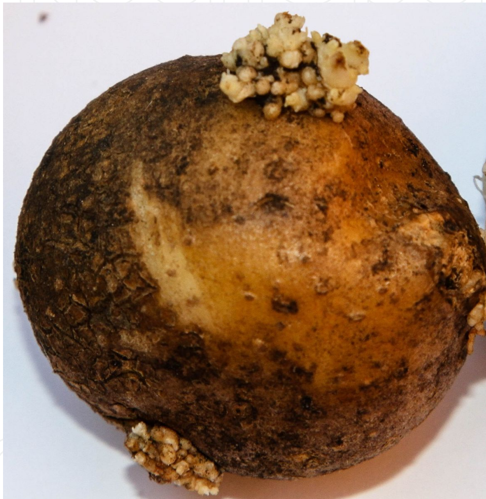
Figure 6. The “cauliflower”-like formation of shoots appearing around a single eye of a glyphosate-contaminated tuber with higher residue levels.

When tubers are uncovered from the soil, more symptoms can be observed that can help identify the problem as glyphosate. In many cases, swelling of shoots or a “candelabra” of branching formation on the shoots may occur. Unique to glyphosate, multiple shoots coming from a single eye may be observed (Figure 5). When glyphosate residue levels are at higher levels in tubers, shoots will not elongate, but a “cauliflower”-like formation of shoots will appear around the eye (Figure 6) [29,38]. If a field has these types of symptomology, carefully inspect the field because differences will be apparent by cultivar and the amount of glyphosate present in the tubers.