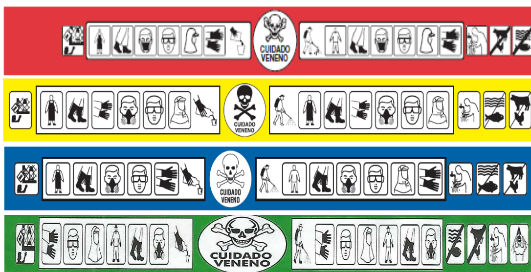
Figure 3. Warning band required at the bottom of the label, colored according to the toxicological class and pictograms about environmental and worker safety.

The label central column shall contain the manufacturing and expiration dates, indications whether the content is explosive, flammable, oxidizing, corrosive, irritant, or subject to applied sales. The following warnings should also be on the label: "The use of personal protective equipment is required. Protect yourself" and "The return of the empty package is required," along with the toxicological and potential environmental hazard classification.