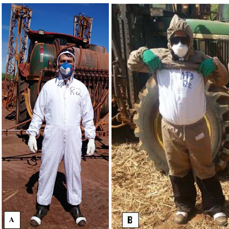
Figure 2. Workers applying pesticide in the field during assessment of potential dermal exposure: A—quantified in coverall and unprotected, exposure real: B—quantified in coverall worn under the personal protective equipment during the evaluation period, according VBC 82.1 [36].