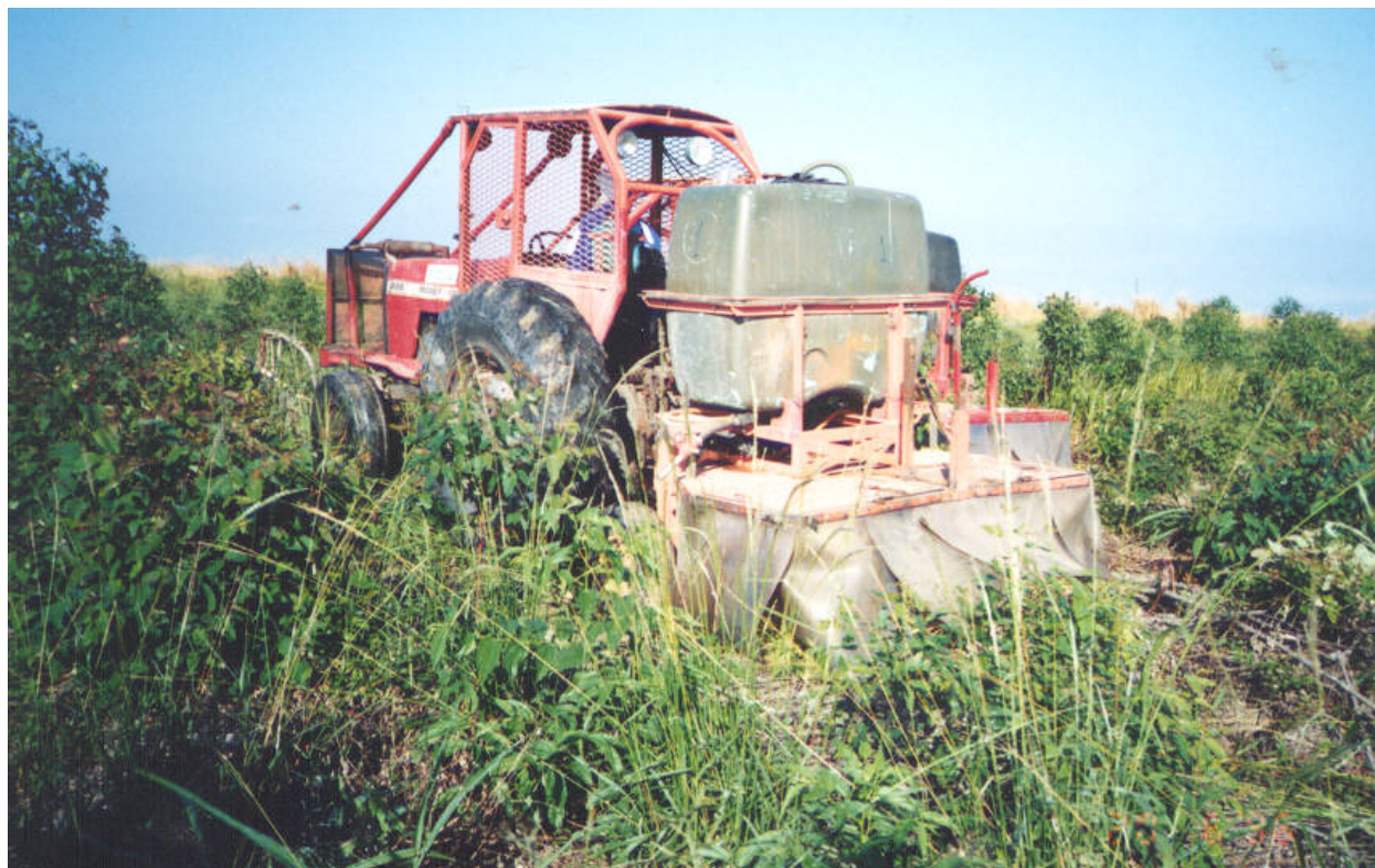
Figure 4. Sprayer bar protected with plastic blades attached to the bar used to apply nonselective herbicide between plant rows in eucalyptus plantation areas [24].

The total exposure of the tractor driver without individual protection, but with protected spray bar, was 838.88 mg/day of glyphosate and MOS of 8.62 [24]. Therefore, the protection of the spray bar made the tractor driver work safe, with acceptable poisoning risk and tolerable exposure levels.