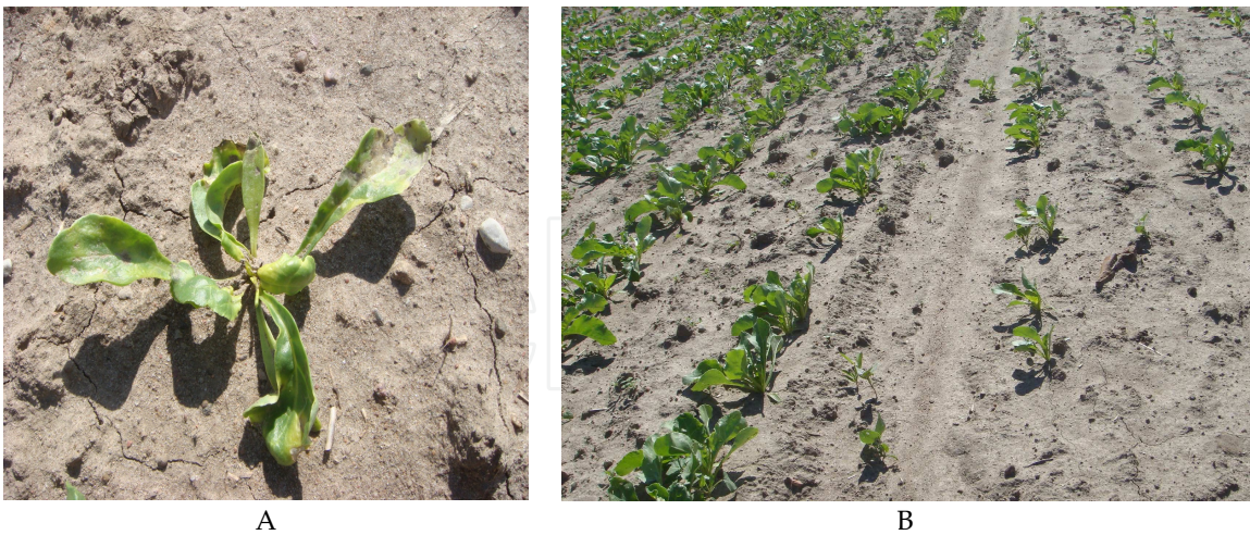
Figure 2. Sugar beet injury from preemergence application of metamitron: (a) yellowing, (b) thinning

The infestation of Chenopodium album (CHEAL), Fallopia convolvulus (POLCO), Galium aparine (GALAP), Stellaria media (STEME), and Lapsana communis (LAPCO) were noted (Table 4). After herbicide application, significant changes were noted in the weed flora. When chloridazon was applied preemergence or postemergence, the herbicidal activity was very high. Preemergence