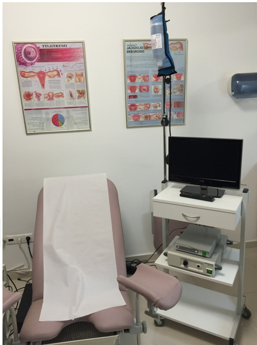
Figure 1. Typical setup for office hysteroscopy in a private office-based practice

The aim of this chapter is to familiarize the clinicians in the field of gynecology with the instrumentation and setup, the technique itself, indications, and contraindications for performing office hysteroscopy and finally the advantages for the patient and the clinician who perform this endoscopic approach.