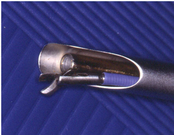
Figure 3. Distal part of an office operative hysteroscope

almost never needed, as long as due to the flexibility the scope can easily go through all types of uterus (anteverted, retroverted, etc.). Finally, there is clear evidence that in procedures where flexible hysteroscopes are used patients experience less pain and discomfort [1].