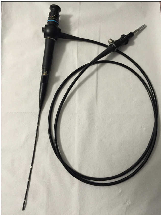
Figure 4. Flexible hysteroscope of 3.1 mm total diameter