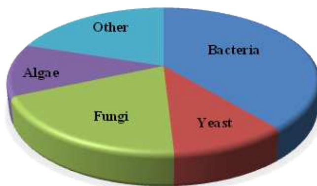
Figure 1. Types of microorganisms used in bioremediation processes.

The number of publications on the use of microorganisms for the removal of heavy metals in contaminated environments has been increasing steadily over the past 10 years. Figure 1 shows the main types of microorganisms used in these processes, based on a search for papers reporting microorganisms and bioremediation studies, indexed in the ISI Web of Science for the period of 2004 to 2014. It can be observed in Figure 1 that the microorganisms that have been most commonly used are bacteria and fungi, although yeast and algae are also frequently applied.