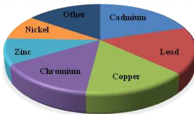
Figure 2. Metals used in bioremediation process employing microorganisms.

Figure 2 gives some indication of which metals are used in bioremediation processes employing microorganisms, and chromium, copper, cadmium, and lead together account for 70% of applications, although nickel and zinc are also used. Other metals that are used to a lesser extent include arsenic and mercury.