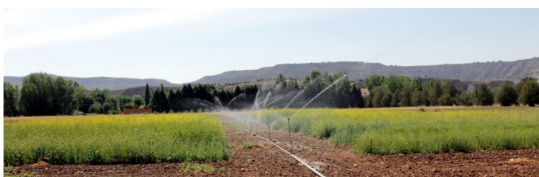
Figure 1. Cultivar trials in the experimental farm “La Canaleja”