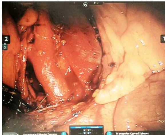
Figure 4. Para-aortic lymph node retrieval.

Our patients undergo a bowel prep regimen. Patients are positioned securely on a foam memory pad with Velcro straps placed across the breasts. This is critical for the 29° Trendelenburg position for the entire case. Patients are placed in lithotomy in Allen stirrups. A uterine manipulator is used in the majority of cases. Typically, 5 ports are placed as shown in the diagram, Figure 1.[58] The camera is placed approximately 25 cm above the pubic symphysis. The robot is then docked from the patient's left side. A 0° scope is used. The fenestrated bipolar and the monopolar hot shears are used as the operating instruments.