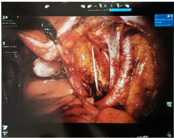
Figure 3. Pelvic lymph node retrieval

Techniques include either single-site port or multiple port use and other factors play a role in determining which the best approach is used.