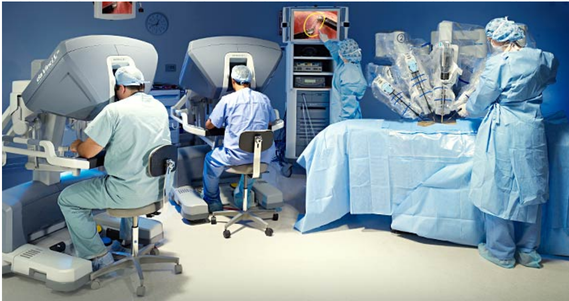
Figure 1. Da Vinci Surgical System with additional training console

bone for implant insertion. In 1998, Computer Motion Inc., marketed another model that had been in development called ZEUS Surgical System (ZSS), which had a 2-D imaging system and robotic arms made to mimic the surgeon's arms. Two arms were added to the AESOP to create the ZEUS. The arms also allowed for downscaling of movement from the surgeon's hands and elimination of tremors. The surgeon sat at a console, which helped to decrease fatigue especially in longer operations and expanded on the possibility of telesurgery or remote location surgery.