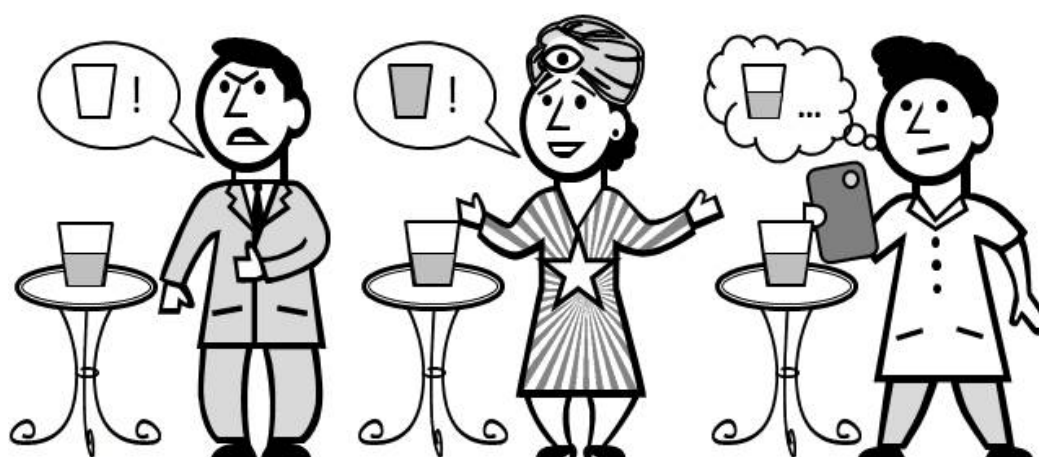
Figure 2. Representation of the two poles of ignorance (the obstinate skepticism and the naive mysticism), and the balanced position

The famous British physicist and cosmologist Stephen Hawking stated: the greatest enemy of knowledge is not ignorance; it is the illusion of knowledge. A conservative scientific position employs observation, empirical investigation, and theoretical explanation of each phenomenon. Figure 2 represents what we call here the two poles of ignorance and the balanced position related to the discussion of DH. The first pole is the obstinate skepticism (arrogant and prejudiced attachment to materialism), that denies the full half. The opposite pole is the naive mysticism (unrealistic trust on paranormal potentialities), that denies the empty half. The balanced position is the option for the enlightened scientificism, a non-dogmatic, open-minded method of acquiring knowledge about nature.