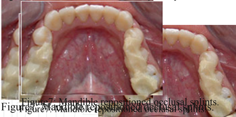
Figure 7: Mandible repositioned occlusal splints.