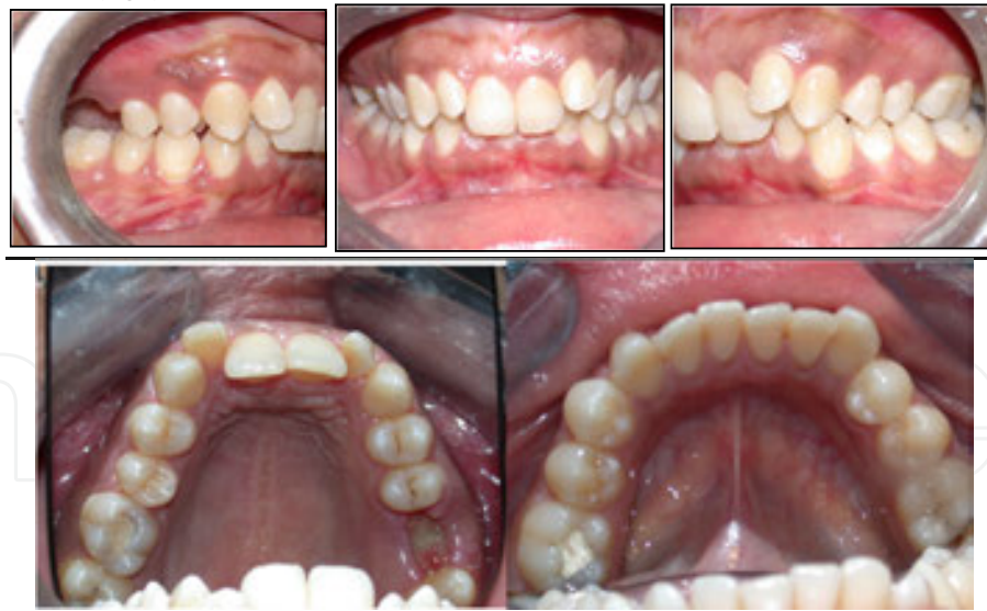
Figure 4: Initial malocclusion in intercuspal occlusal position.

4.2. Case 2 This is the case of a patient, aged 26, who came to the clinic for purely aesthetic reasons related to his malocclusion of CLII div 1 (fig4). Clinical examination revealed a fully functional intercuspal occlusal position used as a reference throughout treatment (fig5). This is the case of a patient, aged 26, who came to the clinic for purely aesthetic reasons related to his malocclusion of CLII div 1 (fig4). Clinical examination revealed a fully functional intercuspal occlusal position used as a reference throughout treatment (fig5).