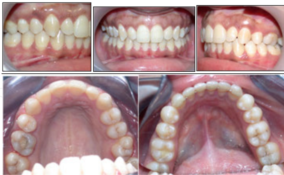
Figure 5: Occlusion treatment.

However, in patients with CMD, the use of the CP is questionable, since it has been defined for an asymptomatic stomatognathic system [53]. However, Rinchuse and CMD and articulator mounting as well as the determination to harmonize CR and IOP brings about very little or no benefit in orthodontics.