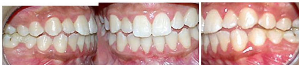
Figure 6: Initial malocclusion in therapeutic position.

This is the case of a 21-year-old patient who had a disc displacement on the left side (fig6, 7, 8).. He was referred to the clinic by his occlusodontist to sustain mandibular position after repositioning occlusal resin splints (fig9, 10).