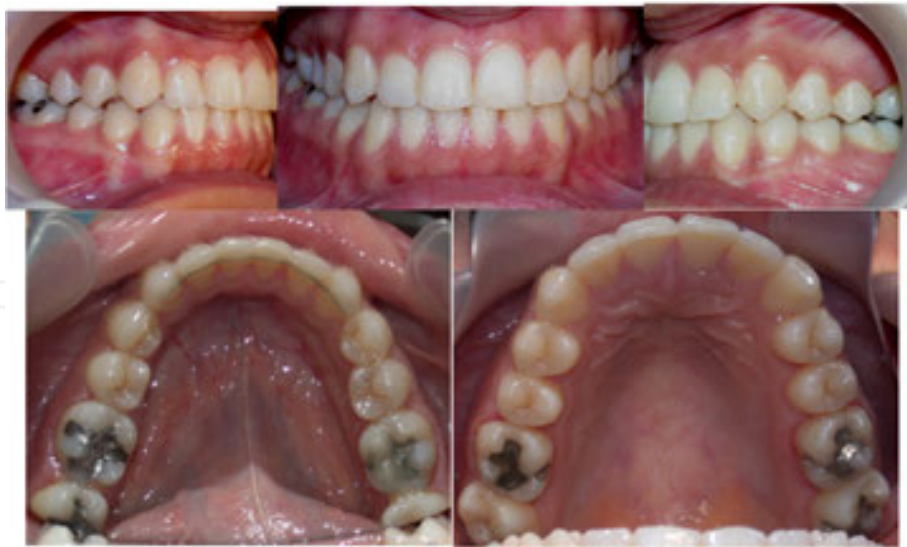
Figure 3: Installation of occlusion in centric relation position. The IOP will only be used if it dictates the mandibular position by a maximum of stabilizing and harmoniously spreading contacts in a position close to centric relation without transversal differential (case 2).

4.2. Case 2 This is the case of a patient, aged 26, who came to the clinic for purely aesthetic reasons related to his malocclusion of CLII div 1 (fig4). Clinical examination revealed a fully functional intercuspal occlusal position used as a reference throughout treatment (fig5). This is the case of a patient, aged 26, who came to the clinic for purely aesthetic reasons related to his malocclusion of CLII div 1 (fig4). Clinical examination revealed a fully functional intercuspal occlusal position used as a reference throughout treatment (fig5).