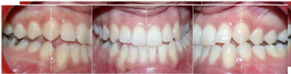
Figure 2: Centric relation position: CIII canine and molar on the right and left side.

The IOP will only be used if it dictates the mandibular position by a maximum of stabilizing and harmoniously spreading contacts in a position close to centric relation without transversal differential (case 2).