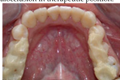
Figure 7: Mandible repositioned occlusal splints.