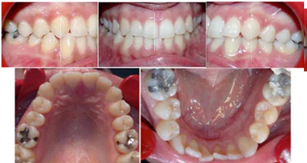
Figure 1: Initial occlusion at the start of treatment. Occlusion is in CII molar and canine on the right side and the left CIII.

This is the case of a young adult aged 20 with inter-incisive deviation (fig1). After the diagnosis of functional origin, manipulation of centric relation showed interarch horizontal changes (fig2). Indeed, the mandible refocuses with the appearance of a right angle and left compared to the class III Angle occlusion. In this case, it is clear that the choice of the mandibular reference will be irrevocably on the centric relation position(fig2). Orthodontic treatment stabilizes the occlusion in the corrected mandibular position(fig3).