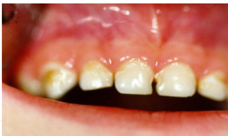
Figure 1. ECC i (initial stage)—white spot lesion or initial defect in enamel of cervix.