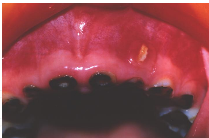
Figure 5. Radix relict and bone penetration