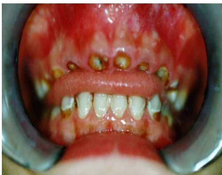
Figure 4. ECC r ( radix relict stage)—total destruction of the crown.