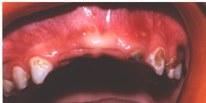
Figure 11. Early extraction of teeth