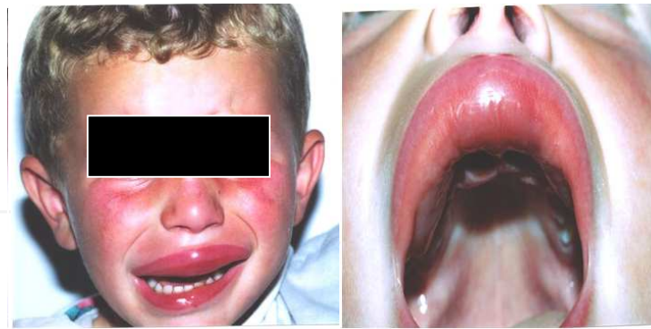
Figure 8. Spread of infection- result of ECC complications

General condition - pain, elevated temperature, fever, loss of appetite, the patient is pale and frightened. The patient cannot be fed as a result of edema of the lip and the gum inflammation. The food intake is affected due to the great sensitivity of the gangrenous roots in the upper front. (Fig.8)