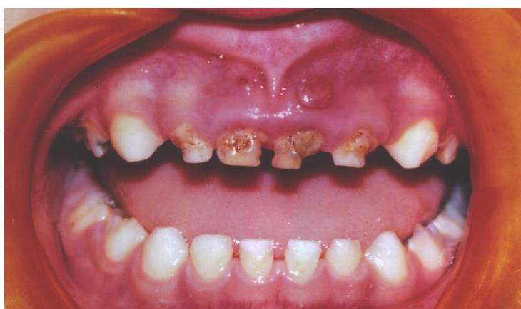
Figure 3. ECC d (destructive stage)—destruction of more than half the crown without affecting the incisal edge.