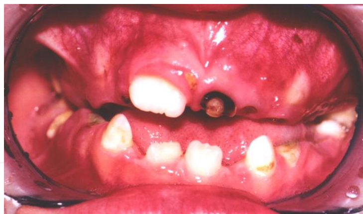
Figure 9. Persistence of radix relicta and disorders of permanent tooth eruption

As a result of root persistence, among others, it may have an effect in the eruption disorders of permanent teeth causing orthodontic abnormality (Fig. 9, 10.)