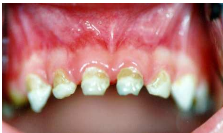
Figure 2. ECC c (circular stage)—lesion in the dentin and circular distribution of this lesion proximally.