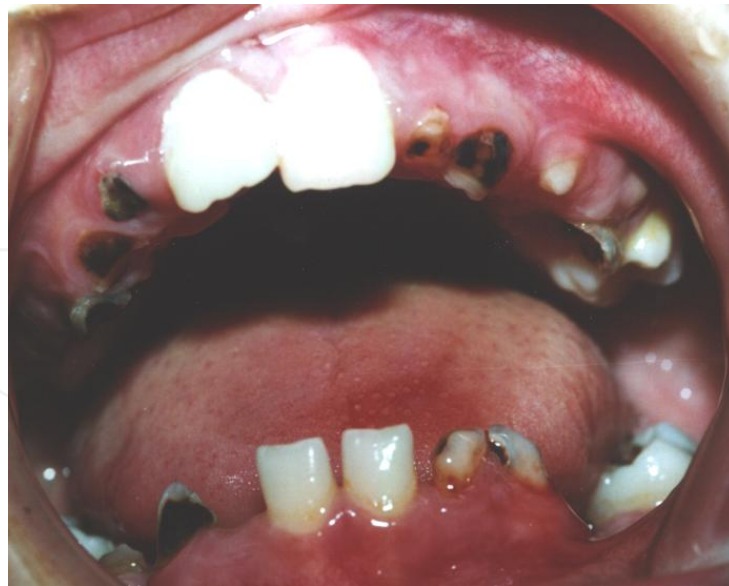
Figure 10. Orthodontic abnormality-result of radix relictia persistence