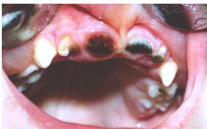
Figure 7. Edematous and hyperemic gingiva

Local situation – the gingiva is edematous, hyperemic and under pressure it is painful. Also while applying a slightly harder pressure from the gingival pocket purulent secret will come out. The tooth is extremely sensitive to palpation and percussion. (Fig.7)