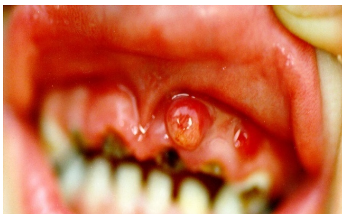
Figure 6. Abscess and fistula

Local situation – the gingiva is edematous, hyperemic and under pressure it is painful. Also while applying a slightly harder pressure from the gingival pocket purulent secret will come out. The tooth is extremely sensitive to palpation and percussion. (Fig.7)