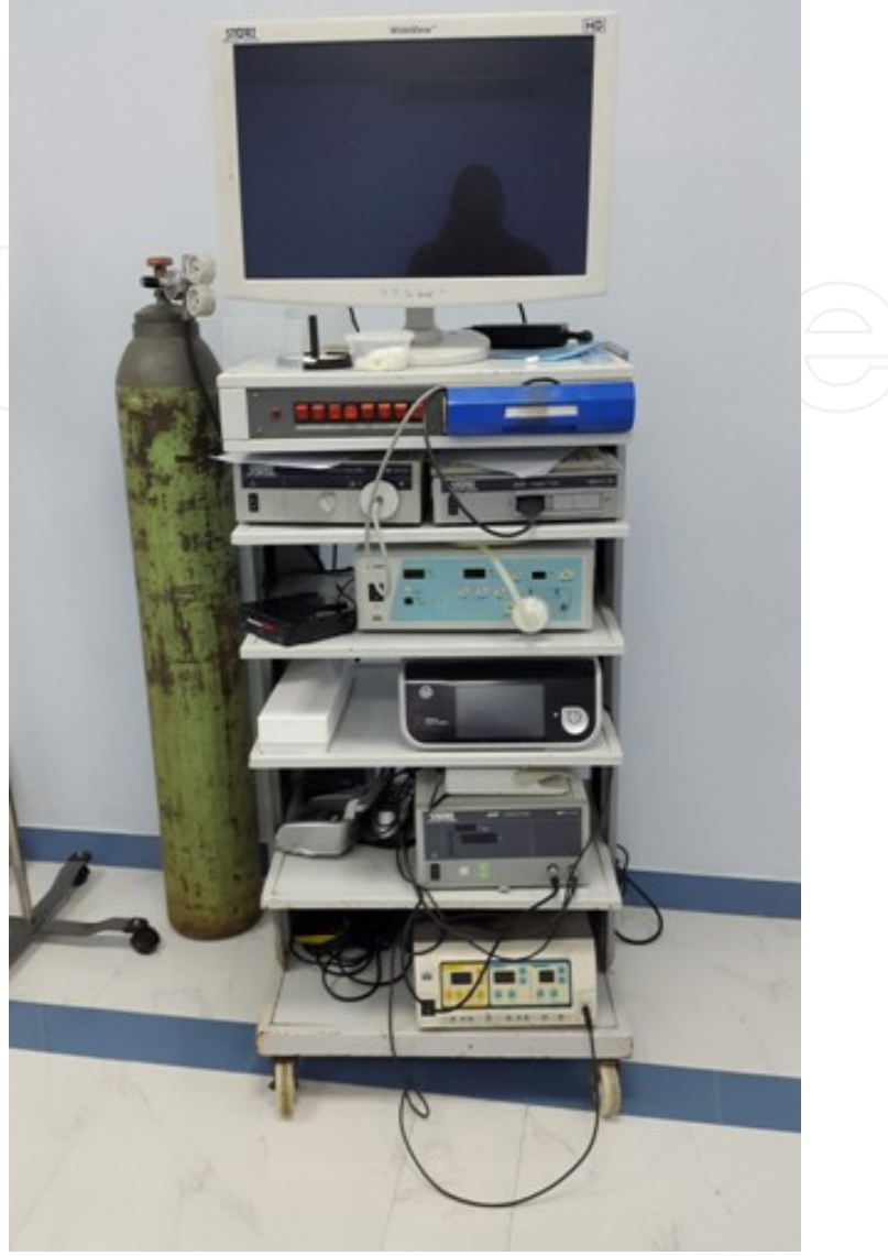
Figure 1. Laparoscopy equipment.