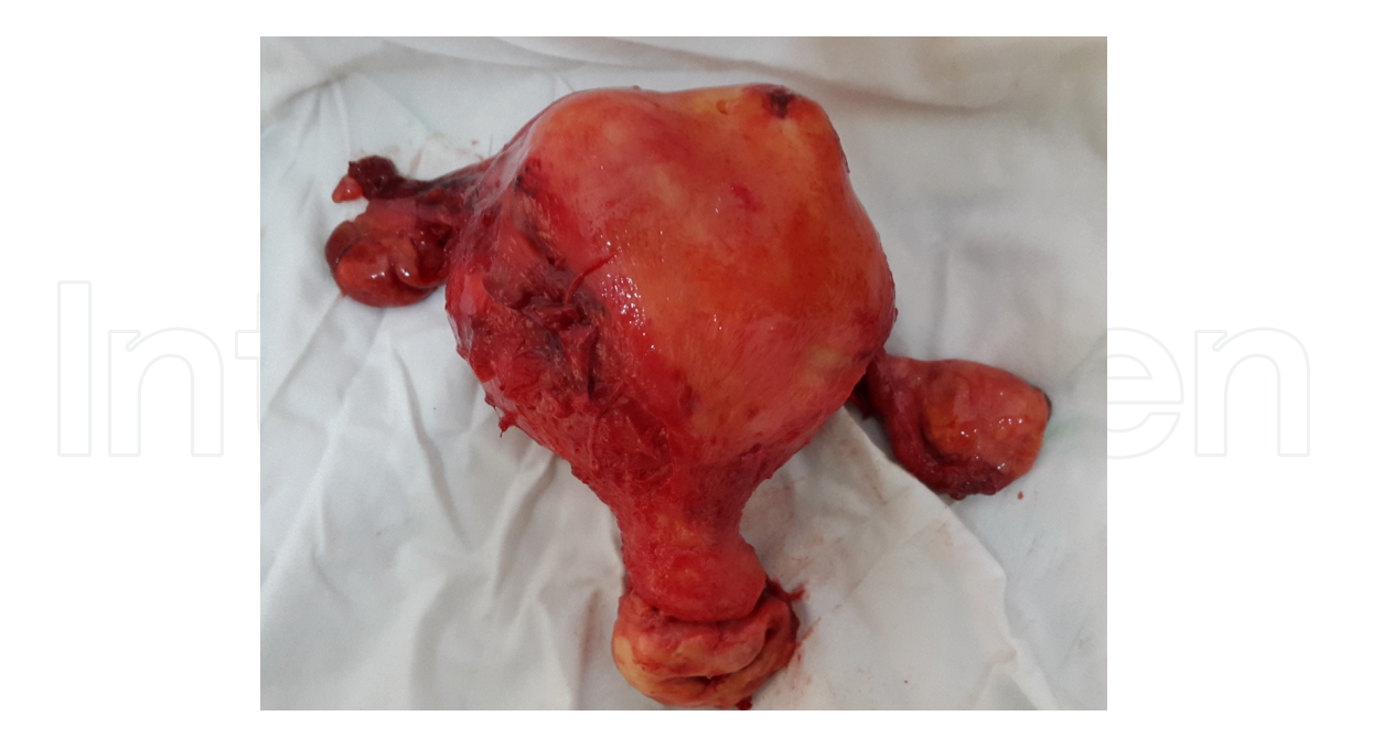
Figure 4. Hysterectomy specimen of a 50-year old woman who had total abdominal hysterectomy and bilateral salpingo-oophorectomy for uterine fibroids associated with menorrhagia.