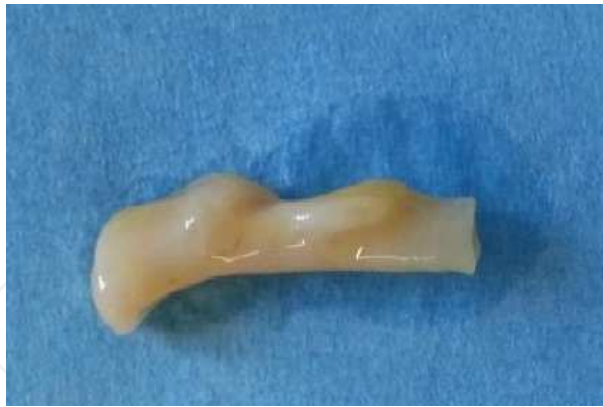
Figure 4. Example of pre-in vivo experimental implant of a decellularized artery. Protocol study of the authors.

There is not a unique decellularization protocol but every tissue need specific reactions and solutions. Protocols usually require a combination of physical, chemical and enzyme processes: the first phases are dedicated to rupture the cell membranes in order to release the intracellular components, which are then separated, dispersed, and degraded by enzymatic detergents and solutions. The last phases are directed to the elimination of cellular debris, that remained within the matrix, and of the reagents, that could interfere with the subsequent recellularization of scaffold or cause adverse reactions into recipient organism [54].