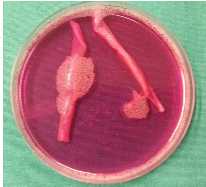
Figure 3. Example of pre-in vivo experimental implant of a biocompatible artificial collagen based artery scaffold. Protocol study of the author.

Other example of bioresorbable material used for vascular purposes could be represented from collagen, which the author has experienced in small caliber vessel replacement in vivo experimental studies (Fig. 3)