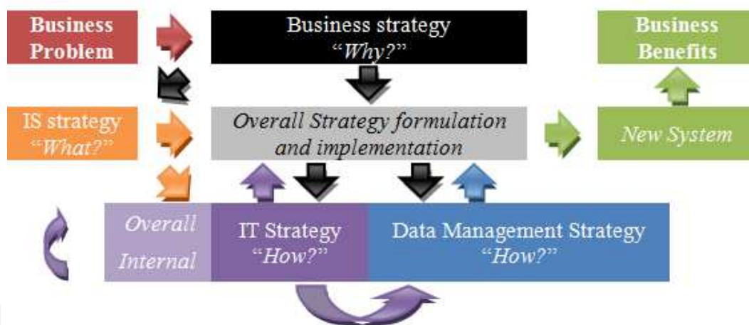
Figure 1. TRANSMIT project overall strategy approach

At the heart of any data related activity is Data Governance (DG). DG is the core function of DM that guides how all other functions are performed and it can be defined as “the exercise of authority and control over the management of data assets” [4]. DG consists of two groups of activities, namely planning and controlling. There are seven planning activities that comprise the DG function, and are typically implemented sequentially. The first two are relevant to our discussion, which are to understand the data/information needs, i.e. of the IPDM prototype, and based on these needs to develop a data management strategy . Moreover, the execution of the DG planning activities, and thus the definition of data strategy, should be driven by both business and IT strategies [4]. In Figure 1, we present a novel framework that captures this dependency by depicting the different components of the overall TRANSMIT project’s strategy and the relationship between them. This novel framework is based on a proper combination of the framework for IT, Business and Data strategies’, described in [4], with the IT, IS (Information System) and Business Strategies’ framework in [5].