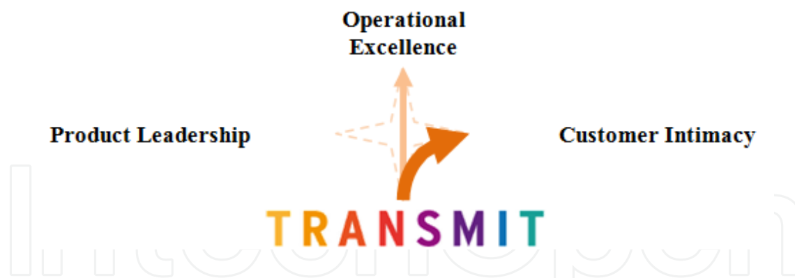
Figure 2. TRANSMIT overall strategy orientations in order to create added value to the end-user and achieve a competitive advantage, based on the three dimensions defined in [15].

To ensure the sustainability of the TRANSMIT endeavor, a clear differentiation of the TRANSMIT approach with respect to competitors have to be foreseen. In Figure 2, the primary strategic direction [15] that was chosen is the "customer intimacy" or "customer focus". This practically means that the business improvements offered in the form of services or products are tailored to the needs and processes of individual customers (i.e. Fugro) by solving their business problem. Product leadership, which implies continuous and rapid introduction of new products and services, was difficult to be achieved given the complexity of the business problem, the existing competition, such as NASA, ESA and NOAA just to name a few, and the nature of TRANSMIT project. In the next two sections however we will see how the operational excellence can be targeted/supported by the IS, IT and Data strategies, as a secondary improvement dimension, which in principle requires improvement/optimization of business performance.