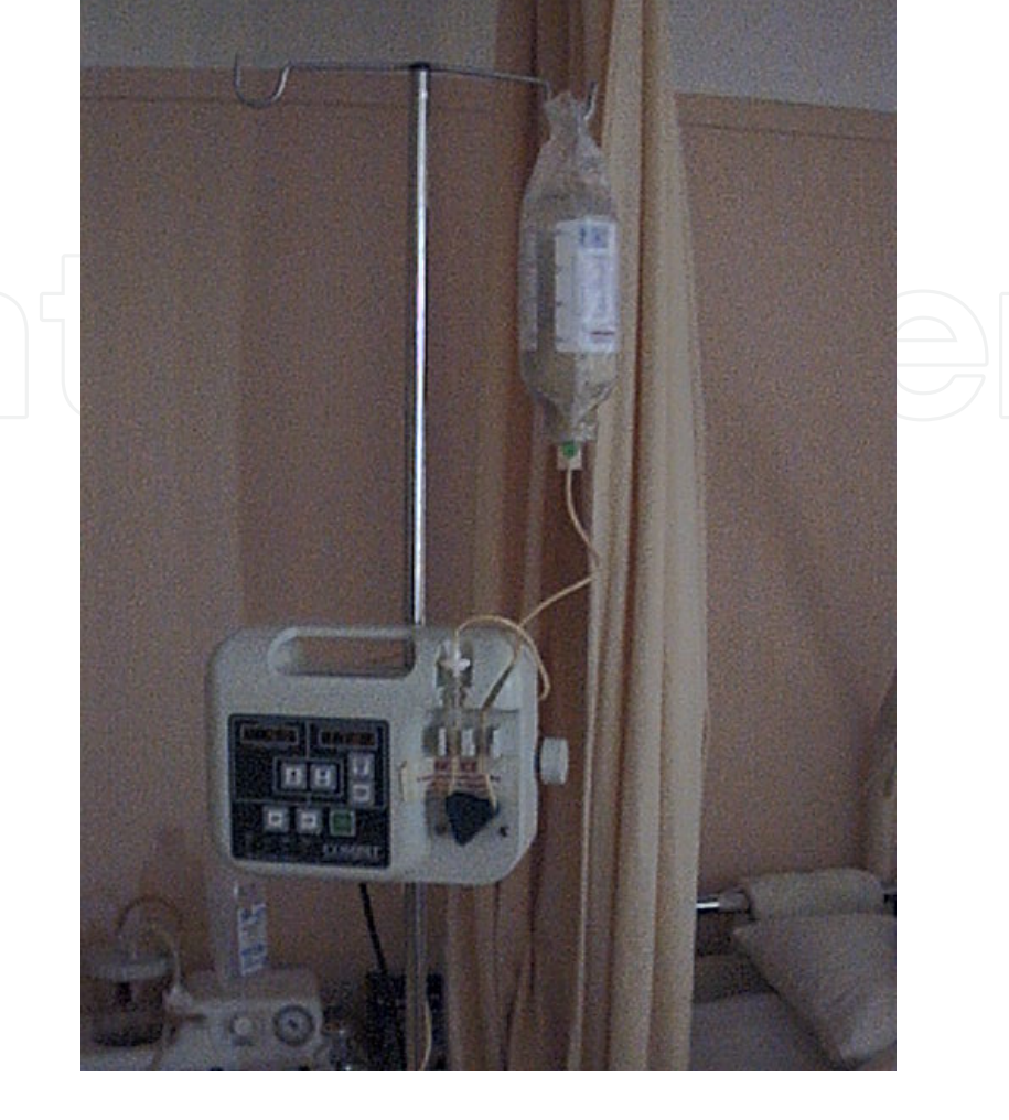
Figure 2. The enteral feeding pump type COMPAT. The system is a relatively simple, lightweight, easy to use for managing all types of enteral feeding. Have an audible and visual alarm that alerts you when each of the following conditions: empty container feeding, low battery, change the dose, or the existence of j free flow out of the system (waste). The memory of the pump retains infusion rate, volume delivered, dose limit even after turning it off. It is designed to provide precision dosing. Start enteral feeding schedule and progress.

where enteral feeding is expected to be required for longer than 2–4 weeks, for example in patients with acute stroke [91]. Although complications of PEG tube feeding are rare in stable patients, they become increasingly common in critically ill and debilitated patients. One of most feared complication of enteral feeding: aspiration hypoxia/ pneumonia. Clinically, gastric residual volume (GRV) measurement was frequently used as marker to predict aspiration & pneumonia. Elevated GRV: associated with comorbidities such as vasopressor use, sedation sepsis, vomiting. GRV: no significance between GRV>200ml and GRV>400ml, low sensitivity as a marker of aspiration [92].