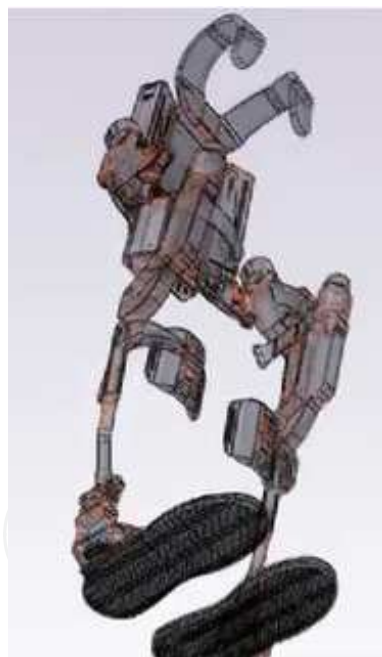
Figure 3. "eLEGS" exoskeleton by Berkeley Bionics

In 2010 Berkeley Bionics unveiled eLEGS, which stands for "Exoskeleton Lower Extremity Gait System". eLEGS is another hydraulically powered exoskeleton system, and allows paraplegics to stand and walk with crutches or a walker. In 2011 eLEGS was renamed Ekso. Ekso weighs 20 kg, it has a maximum speed of 3.2 km/h and a battery life of 6 hour [47].