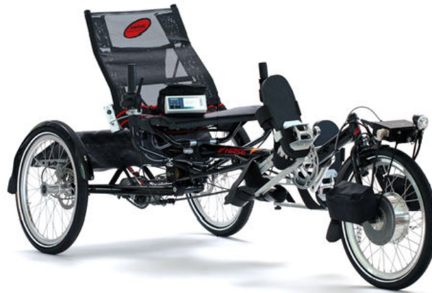
Figure 5. The "RehaBike" by Hasomed (outdoor bike)

In general, FES cycling ergometers can be divided into two major types, mobile and stationary types. The mobile type, a locomotion device, focuses on muscle training as well as giving some mobility to subjects whose muscles can still be excited. Several research groups have developed a mobile cycling system using standard or recumbent tricycles for SCI subjects. Usually, the mobile type of cycling ergometer is an open-loop system, which is not only a rehabilitation modality but also a recreational activity.