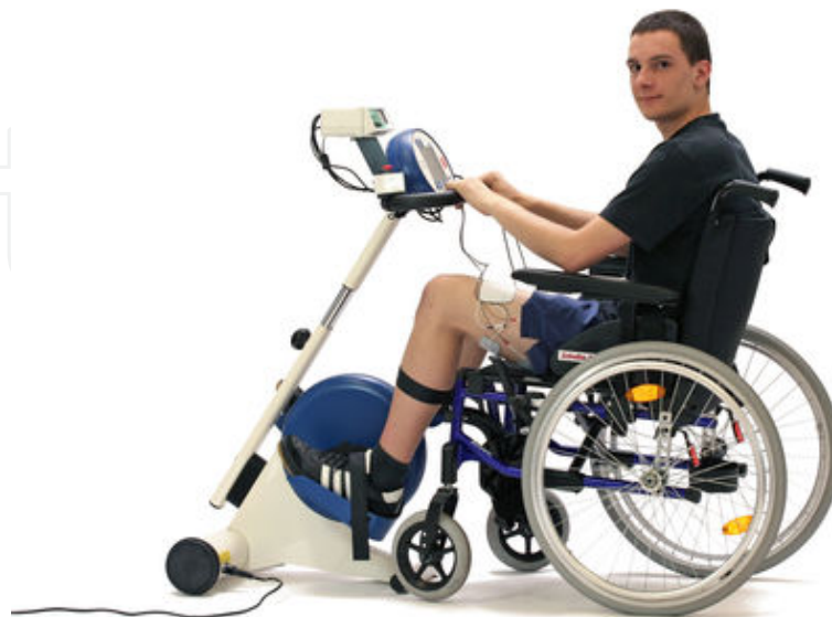
Figure 6. "RehaMove" FES System coupled with Motomed stationary bike

The stationary type of cycling ergometer is usually used for aerobic exercise training in subjects with an SCI to condition their muscle strength and enhance cardiopulmonary function.