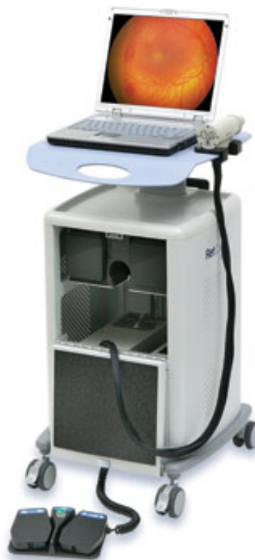
Figure 4. Courtesy of BIOPHOTONICS [74].

compared with the actual ROP screening outcomes. Infants with incomplete weight data were included in the whole group, but were excluded from a subgroup analysis of infants with complete weight data. In addition, data were manipulated to test whether missing weight data points in the early neonatal period would lead to loss of sensitivity of the algorithm. The WINROP algorithm had 73% sensitivity for detecting infants at risk of severe ROP when all infants were included and 87% when the complete weight data subgroup was analysed. Manipulation of data from the complete weight data subgroup demonstrated that one or two missing weight data points in the early postnatal period lead to loss of sensitivity performance by WINROP [63]. It was concluded that the WINROP program offers a non-invasive method of identifying infants at high risk of severe ROP and also identifying those not at risk. However, for WINROP to function optimally, it has to be used as recommended and designed, namely weekly body weight measurements are required [63].