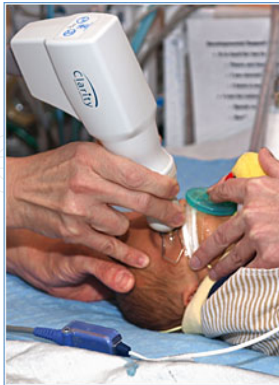
Figure 1. Courtesy of Hoag Levins. Clarity Medical Solutions. [72]