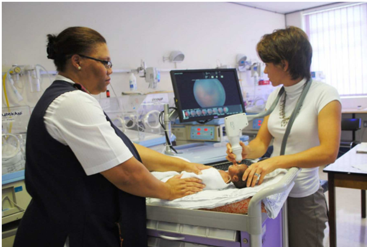
Figure 2. [71]

Risk of sight-threatening ROP developing is considered to be minimal beyond 37 weeks postmenstrual age although any decision to cease screening certain babies before this point in time must be considered with caution. Examination of data from the CRYO-ROP study indicated that babies developing stage 1 or 2 ROP in zone III were at very low risk of developing sight-threatening ROP [55,56]. Investigations for serious ROP should be between 33 and 39 weeks post-conceptual age, while realizing that there is a degree of individual variability in the development of retinal vasculature [56].