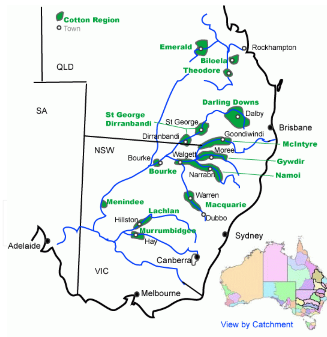
Figure 1. Australian cotton production regions

2% of pima cotton ( Gossypium barbadense ). Since 2010, as a result of a long drought and eventually loss of infrastructure to support its processing, there has been no Pima cotton grown in this country. The Commonwealth Scientific and Industrial Research Organisation (CSIRO) cotton breeding program has developed and released over 100 very successful cultivars adapted to local conditions with a high yield and quality. By 2000, these had displaced all imported cultivars and any other local competition and currently all cotton grown commercially in Australia stems from that program. Between 1995 and 2009, yield progress from the CSIRO program was an impressive 18.3 \text{ kg ha}^{-1} \text{ year}^{-1} , with 48% of that yield improvement directly attributed to cultivar, 28% to improved management and 24% to the interaction between cultivar and management [2], making Australia one of the highest yielding cotton producers per hectare globally.