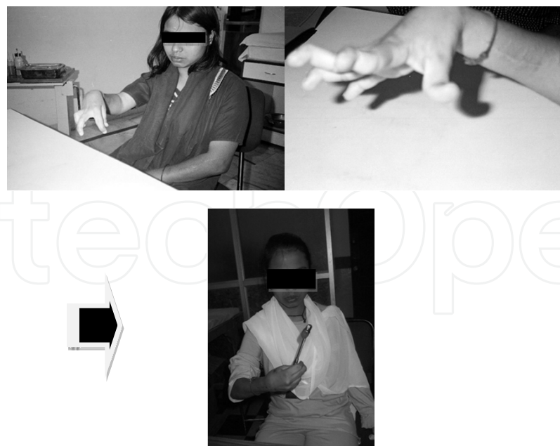
Figure 4. Before and after SEMLARASS

osteotomies, tibial internal rotation osteotomies and medial displacement calcaneal osteotomies, followed by 4 months of post operative rehabilitation.