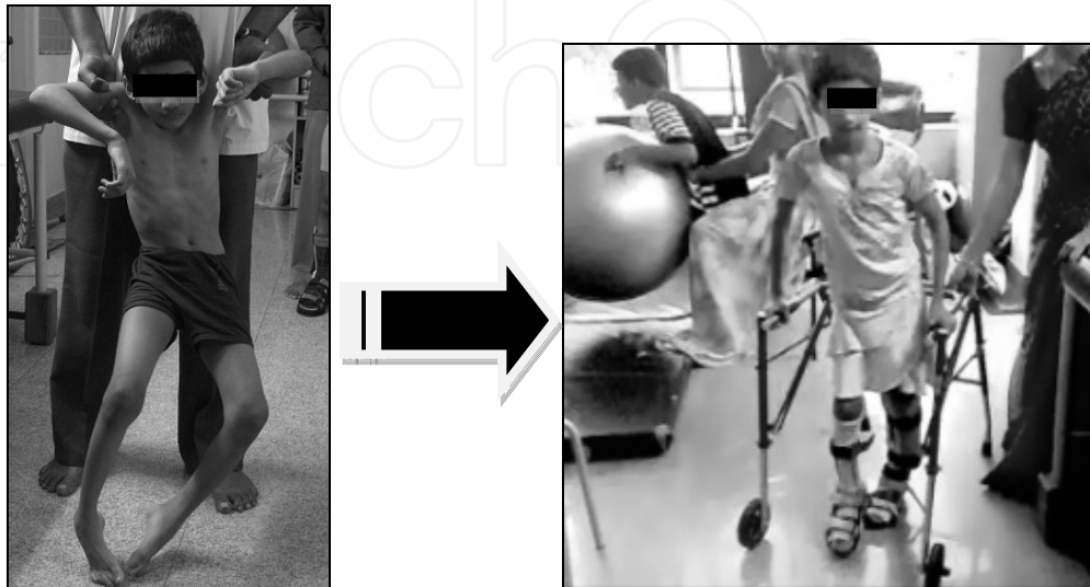
Figure 8. Before and after SEMLARASS

At a follow up of 5 years, she was walking with rollator and sitting without support. She had achieved complete head control and good hand function. Also the abnormal movements were greatly reduced. The current GMFCS level was 3.