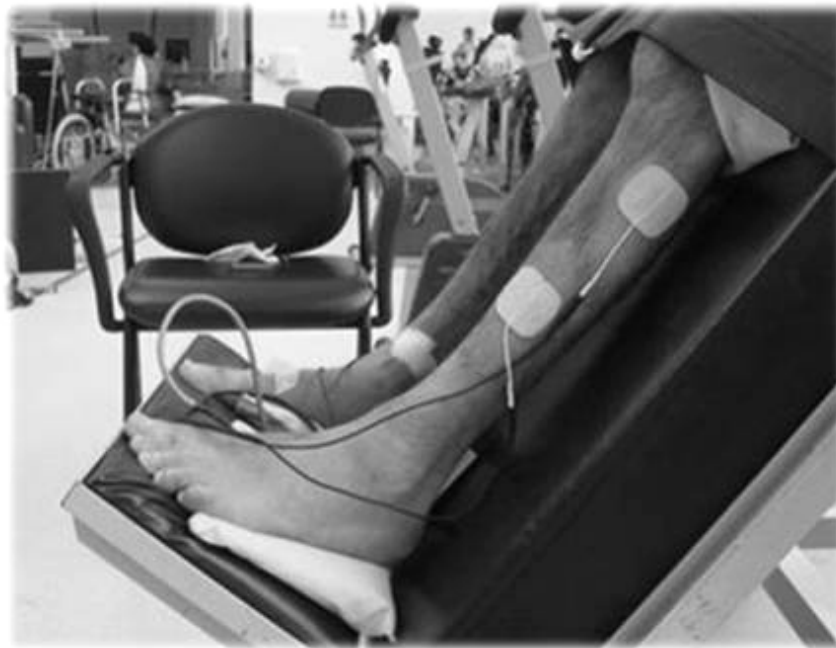
Figure 2. Stretching with electro-therapy on tilt table between casts.

Patient was allowed to rest for 2 days between casts, during which time he continued to stand using the standing frame with therapist assistance and received electro-therapy (Fig. 2).