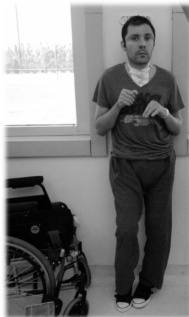
Figure 8. Standing as the final result of the progression of serial casting.

The right hip range limitation was solved surgically several months later. Currently, patient walks independently, requiring supervision for cognitive deficit. As for the upper limbs, right elbow regained normal mobility with conventional therapy and left elbow and wrist flexors required a tendon lengthening surgery.