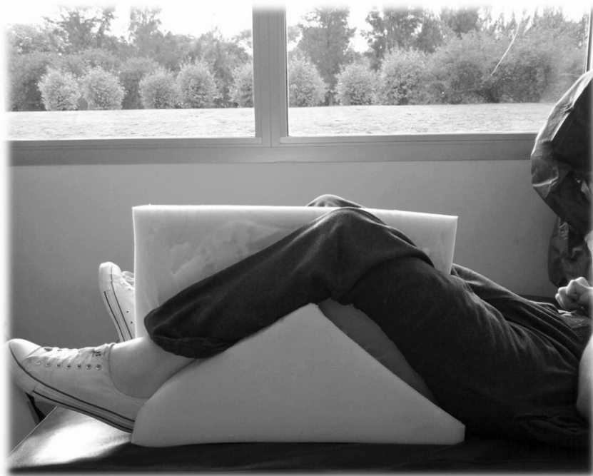
Figure 4. Positioning on bed.