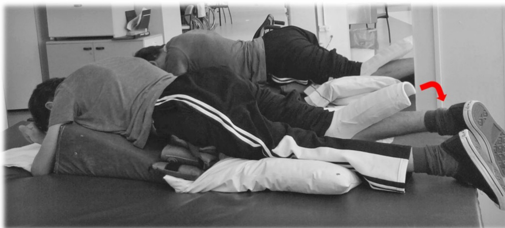
Figure 6. Prone position and exercise with Drop out cast in left knee.