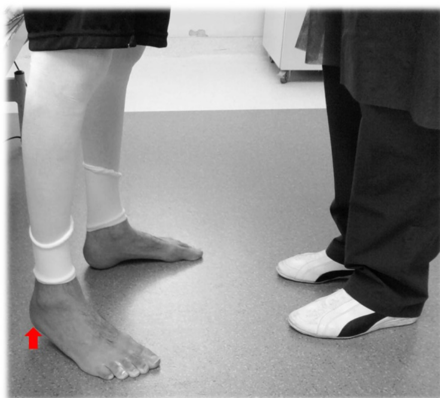
Figure 3. Standing unassisted post final cast without right heel contact on the floor.

Right wrist was extended and fingers flexed. Left wrist was in extreme flexion with metacarpophalangeal (MCP) joints in extension.