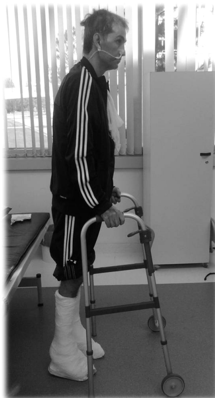
Figure 1. Independent standing with the first of the series of four casts.

Patient quickly recovered skills such as sitting and standing independently, so the team decided to apply four serial casts (Fig. 1). These were changed every 7 to 14 days for a total program duration of two months.