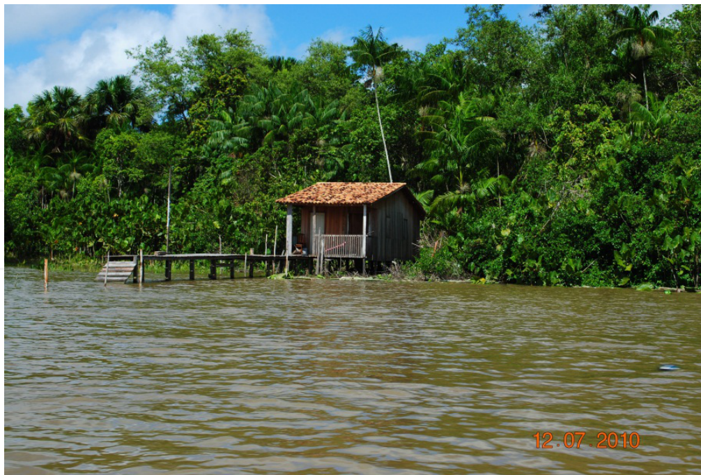
Figure 1. The Amazonian context: the florest and housing typically riverine Amazon

The Amazon river region consists of a forest rich in biodiversity, possessing 20% of the freshwater on the planet. Additionally, it represents 50% of the Brazilian territory and has approximately 11 million people, in which 62.4% live in the cities and 37.6% live in the country [14]. The riverine area still has energetic resources and wealth and is rich with lush flora and fauna, but it is still considered an economically poor region compared with its natural richness because of its historical lack of infrastructure investment [15].