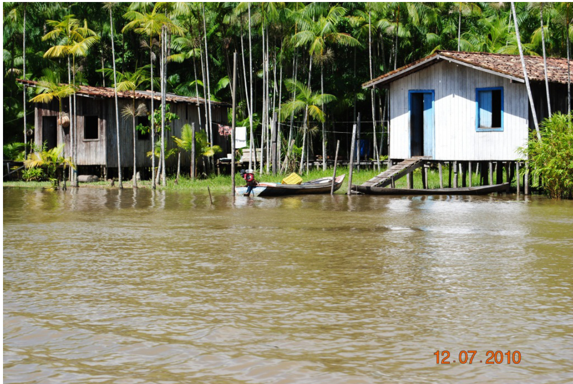
Figure 2. Neighboring houses in the Amazon river context

moments of interaction and developing strong affective bonds. Another important aspect is the fact that the families live together in the same community for generations; therefore, relatives mostly comprise the neighborhood. This composition is indicated in figures 2 and 3.