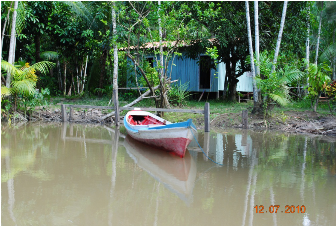
Figure 3. Canoe used to transport families around the house (collection of Laboratory Ecology of Human Development)

Combu Island, drinking water was obtained from a public tap. In Belém, it was carried in buckets and plastic bottles to the community. Therefore, we observed from the daily field records that the community of Combu worried more about water quality compared with the Araraiana community.