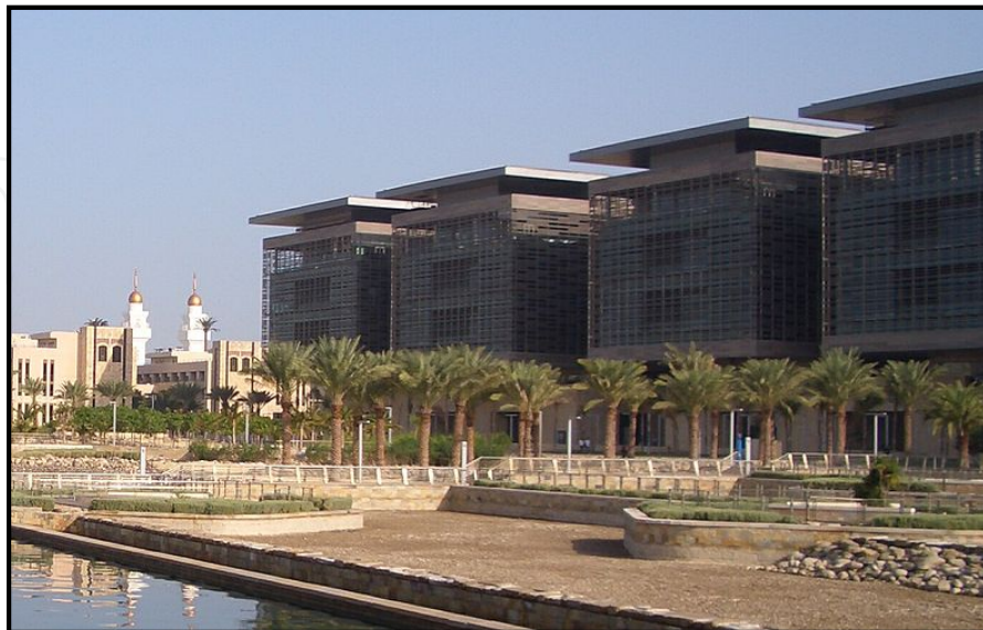
Figure 8. Building facade with window screen similar to traditional mashrabiyyah

Saudi Arabia has carried out some projects that are exemplary for sustainable urban design. One of the projects is the Mashair metro project, which was inaugurated to improve transportation system during the yearly pilgrimage (Hajj). The Mashair trains have the capacity to transport about 550,000 pilgrims between the holy sites (Arab News, 2012). The project could promote sustainable urban design, by reducing carbon emissions and encouraging transit-oriented development, as the trains will replace about 53,000 buses (Barry, 2009). Due to the initial success of the project, other metro projects have been initiated for Jeddah and Riyadh cities and to link Makkah with Madinah (Haramain Metro). Another prominent design project is King Abdullah University of Science and Technology (KAUST) campus project. This is the first project to be awarded LEED certificate in Saudi Arabia (Almatawa et al., 2012). The project was based on sustainability principles from the scratch and they implemented a sort of GeoDesign for the design of the campus and monitoring of different sustainability parameters (Elgendy, 2010). The sustainable and traditional design principles implemented in the project include; compact city planning, traditional suq (market), traditional passive ventilation, mashrabiyyah (Fig. 8), passive design, energy and water conservation (Elgendy, 2010).