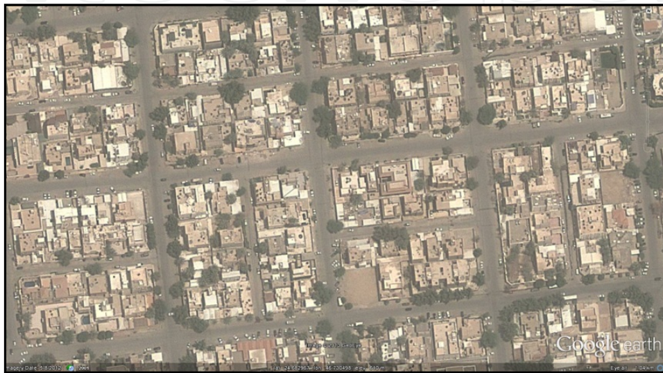
Figure 4. Structural pattern of Al-Malaz neighbourhood

1373/1957 when government headquarters was moved from Makkah to Riyadh. Al-Malaz was planned following a grid-iron pattern with an hierarchy of streets, rectangular blocks, and large lots which in most cases are square in shape (Fig. 4) (Al-Said, 1992). The main thoroughfares are 30 meters in width, secondary streets 20 meters, and minor streets or access streets of 10 and 15 meters. The block areas are 100 by 50 meters. The typical lot size is 25 by 25 meters, with some variations in width (Al-Said, 1992). The Al-Malaz neighbourhood structural pattern was consequent upon the contemporary building requirements which stipulated the planning of the land, subdivision with cement poles, heights of the buildings, setbacks and square lot ratio of the buildings.