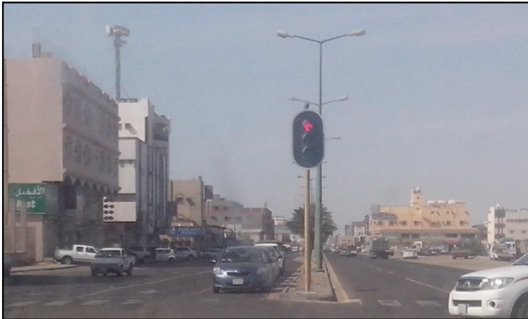
Figure 5. A wide street of the contemporary urban form

erecting additional structures over fences to ensure privacy and by not using their yards for female activities (Al-Hemaidi, 2001). Social sustainability is also affected by the use of cars for movements within neighbourhood such as going to school, mosque or shops instead of walking (Al-Hemaidi, 2001). Thus, Elaraby (1996) opined that the new mix of Western styles of design and characters that have appeared recently have changed the spatial environment of many Islamic countries for worse. The challenge is to develop a framework of adopting the modern technology and design principles without jeopardizing the elements of traditional values, forms and design.