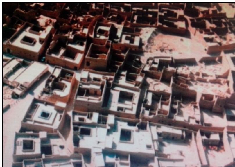
Figure 1. Traditional courtyards

The traditional urban form in Saudi Arabia is similar to that of most traditional Muslim cities. The traditional urban fabric is characterized by organic narrow winding street pattern, with homogeneous arrangement of housing plots. The houses open inward in form of courtyards (Fig. 1) and are centred on mosques, markets 'suqs' and madrassas. As noted by Bianca (2000), "the formation of the urban structure is not subject to the purely quantitative division of large space into smaller fragments but based on an incremental or 'organic' aggregation process, originating in the definition of socially relevant micro-spaces which are then connected into larger units. The enclosure of voids by correlated solids, repeated in countless variations, is the generating principle of urban form". Pacione (2001) highlighted the elements of traditional Islamic city as the obviation of the need for public buildings; the centring of city on mosques that provide a range of welfare and education functions; the bazaar or 'suq'; the residential fabric that is composed of a compact structure of open courtyard houses; and the irregular street pattern. The irregularity of forms of the traditional urban fabric does not necessarily connote lack of order but depicts coherent and harmonious integration of diverse elements to make a whole.