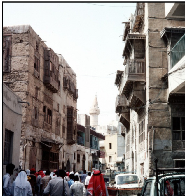
Figure 3. A narrow street in Old Jeddah (buildings have traditional wooden window screen "Mashrabiya" for privacy)