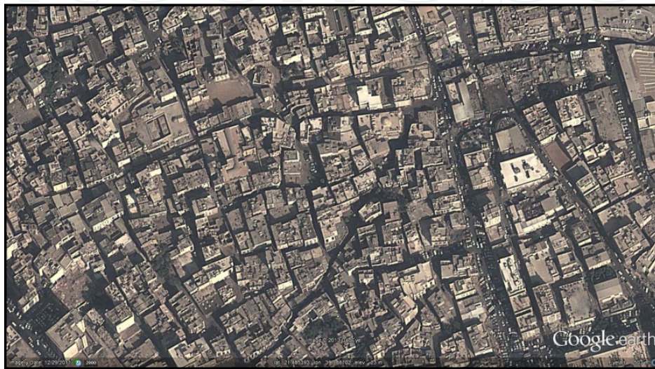
Figure 2. Street patterns in old Jeddah

Saudi Arabia does have some specific characteristics that are peculiar to it. The old Jeddah town was significantly different from other Islamic cities by its lack of central space allocated to governmental or religious institutions (Fig. 2). The core of old Jeddah emerged around the central 'suq' or market surrounded by residential quarters (Khan, 1981). Nevertheless, the social and communal activity still centred on the mosque. The main arteries are very few numbering about five, including the major axis along the 'suq' or market. The width of the roads varied according to function and location. The narrower lanes were located within residential quarter (Fig. 3) while the wider streets served the shopping areas and transportation of goods.