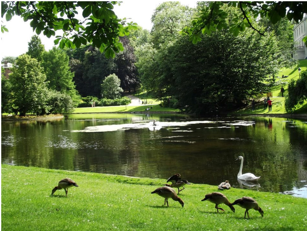
Figure 2. Waterways in urban areas as opportunity for promoting biodiversity (photo from Brussels-Belgium taken by Aysel Uslu)

Streams and other waterways as natural corridors in urban areas are another opportunities for promoting biodiversity. If these corridors are well managed, they can improve biodiversity not only in the habitats beside the land but also can have positive effects on the proliferation of aquatic species (Figure 2).