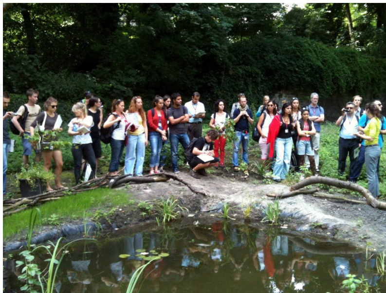
Figure 11. Promoting awareness of biodiversity to local communities (photo from Brussels in Belgium taken by Oguz Yilmaz)

Finally, it must be noted that, creation and improvement of urban biological diversity processes require time. Therefore, the programs and design methods should be based on characteristics of the local ecology considering the time required for each stage. Also, it must be highlighted that, to be successful in conserving biodiversity, the value of nature in public mind must be made clear. Also, by using different levels of environmental education, government raises environmental awareness of urban residents to ensure the next generation life in cities. The reason is that most of the biological diversity restoration and improvement work would not have been possible without the participation of volunteers and urban residents (Figure 11).