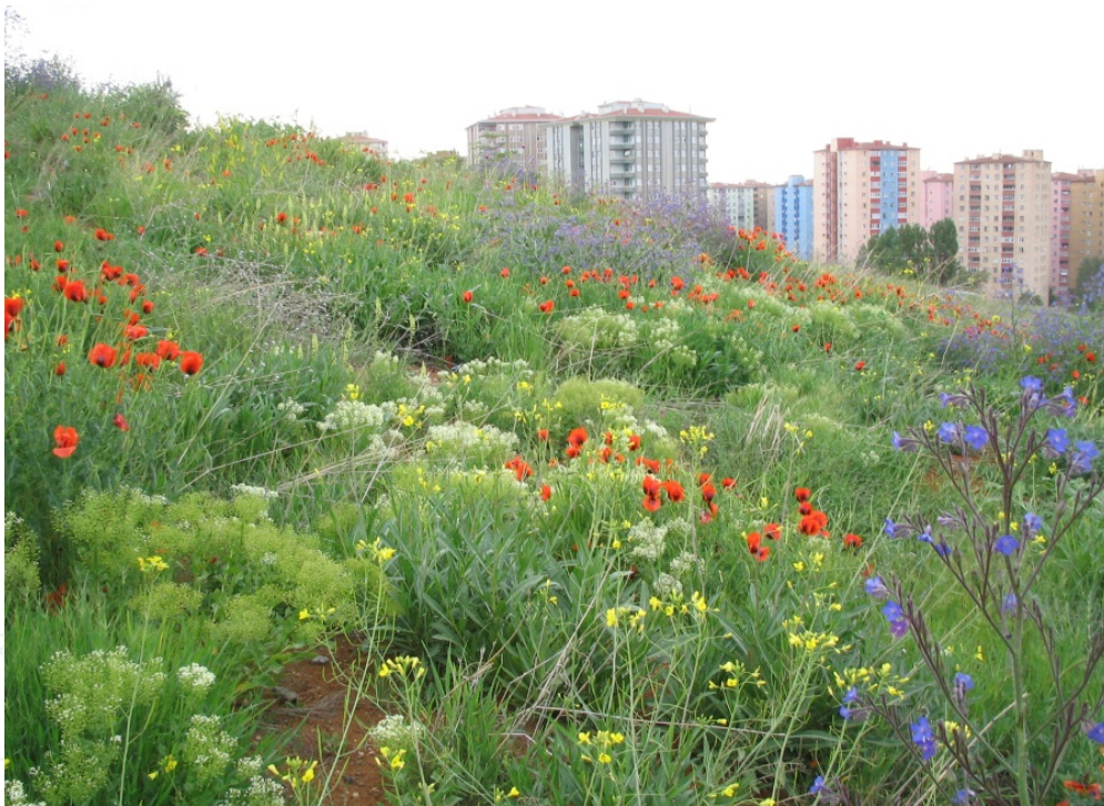
Figure 5. An area with wildflower inside the city borders is valuable for urban biodiversity (photo from Ankara-Turkey taken by Aysel Uslu).

Today, there are many examples of strategies for bringing cities and nature more closely all over the world. The use of native species for ornamental purposes, establishment of conservation areas, revitalization of the nearby water river basin, planning for tree lined streets and linear parks are some of these strategies. European cities offer many examples of these kinds of efforts to incorporate green features and nature into the design of the built environment in urban areas.