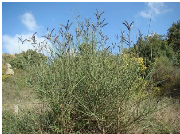
Figure 24. Spartium junceum L.