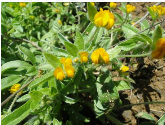
Figure 20. Hymenocarpus circinnatus L.