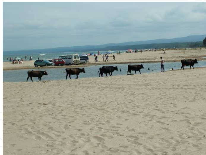
Figure 9. Sand dune areas are important for recreational activities.

Native vegetation provides many benefits principally through the protection of the land surface, amelioration or modification of local climate, maintenance of critical ecosystem processes, conservation of biodiversity, enhancement and protection of cultural and aesthetic values, and the provision of economically important products such as timber and grazing forage. However, significant degradation and loss of native vegetation has taken place since European settlement, principally as a result of human activity (Smith, et. al., 2000).