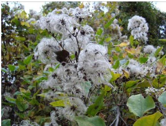
Figure 23. Clematis vitalba L.