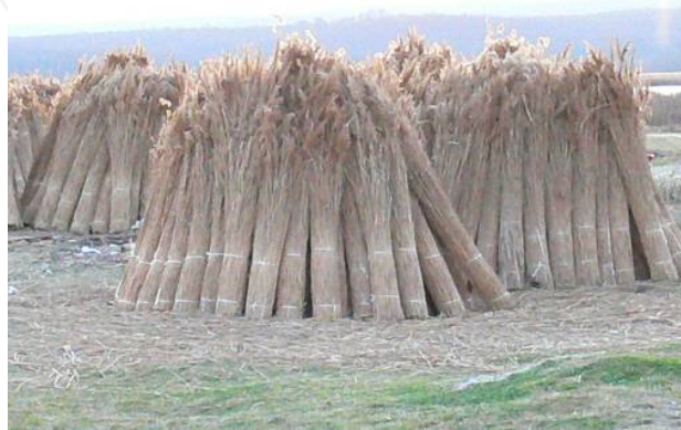
Figure 4. Reedy areas, is applied to the regular cutting program has an important economic function.