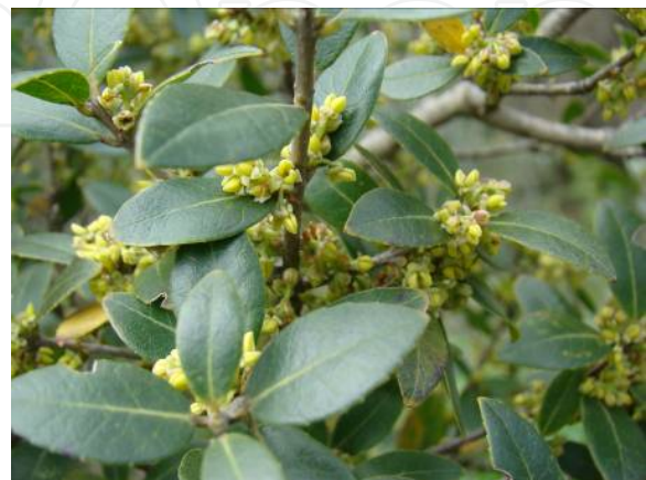
Figure 21. Phyllrea latifolia L..