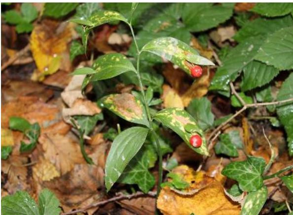
Figure 18. Ruscus hypoglossum L