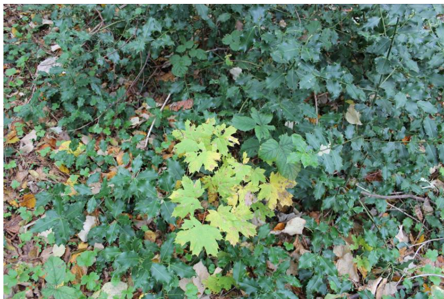
Figure 6. Different plant species in small area ( Acer platanoides , Hedera helix , Ilex aquifolium , Rubus sp.)

Plants form the key elements stored in the primary energy production. All living things depend on other living plants. Native plants natively occur in the region in which they evolved. While non-native plants might provide some of the above benefits, native plants have many additional advantages. Because native plants are adapted to local soils and climate conditions, they generally require less watering and fertilizing than non-natives. Natives are often more resistant to insects and disease as well, and so are less likely to need pesticides. Wildlife evolved with plants; therefore, they use native plant communities for food, cover and rearing young. Using native plants helps preserve the balance and beauty of native ecosystems (Figure 6.).