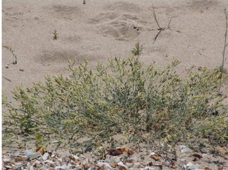
Figure 13. Silene sangaria Coode & Cullen (endemic)

north, north west, south of the south-westerly winds, the creation of different climates. Therefore, the vegetation varies in the vertical direction only, but also by looking also varies widely (Figure 14).