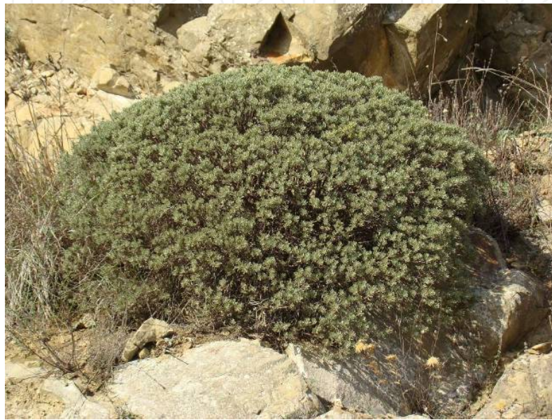
Figure 7. Thymelaea tartonraira an important plant in arid area

climate, soils, timing of rainfall, drought, and frost; and interactions with the other species inhabiting the local community. Thus native plants possess certain traits that make them uniquely adapted to local conditions, providing a practical and ecologically valuable alternative for landscaping, conservation and restoration projects, and as livestock forage. In addition, native plants can match the finest cultivated plants in beauty, while often surpassing non-natives in ruggedness and resistance to drought, insects and disease (Virginia Department of Conservation & Recreation, 2012) (Figure 7.).