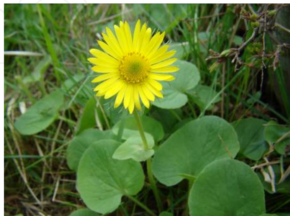
Figure 26. Doronicum orientale Hoffm.