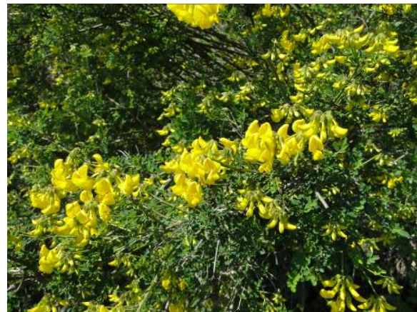
Figure 19. Emerus majus Mill.