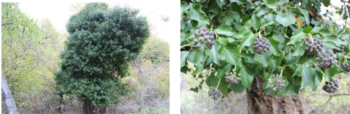
Figure 1. Hedera colchica (This plant is covered Prunus avium and has taken its place)

The number of species present in a location depends on the type of ecosystem. Subtropical rainforests usually contain over 100 vascular plant species in a hectare, including 30-40 tree species, whereas a hectare of cool temperate rainforest may contain only 5-10 tree species. Grassy woodlands and heaths may also be diverse with more than 100 species in a hectare, although sometimes these vegetation types contain relatively few species. However, ecosystems with relatively few species, such as temperate rainforests, can be important for species diversity if those species are unique. The diversity of various animal species assemblages varies even more than that of plants, and some groups also show distinct seasonal variation (Smith, et. al., 2000) (Figure 1.).