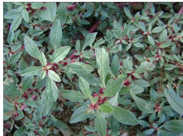
Figure 30. Parietaria sp.