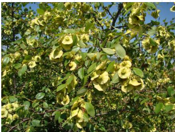
Figure 25. Paliurus spina-christi Mill