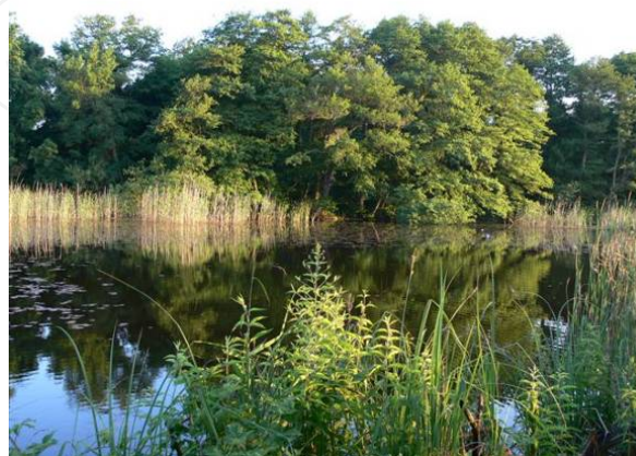
Figure 3. The Saka Lake, İğneada, Kırklareli, Turkey (It is an important area for a variety of birds and plants)

The intrinsic values relate to the actual species and species associations. Two species assemblages may have different intrinsic values but may still have the same functional value in terms of the part they play in maintaining ecosystem/ecological processes (Environmental Protection Authority, 2000).