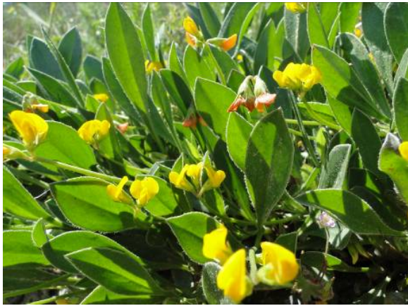
Figure 22. Scorpiurus muricatus L. Fiori.