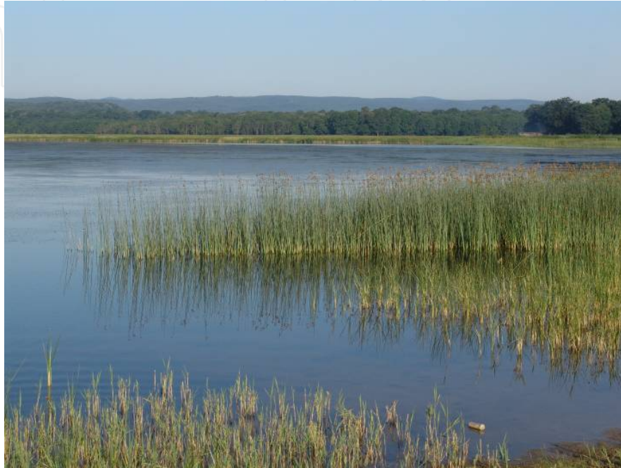
Figure 10. The Mert Lake, İğneada, Kırklareli, Turkey

The native vegetation is directly related to land use and environmental change and is the most easily visible and perceived part of the landscape. It is important in relation to visual effects. However, without detailed studies cannot be understood fully the relationship between other landscape elements. According to Peter et al. (2000), as well as providing essential habitat, native vegetation, including small isolated remnants and scattered trees, has an important role in providing connectivity across the landscape (Figure 10).