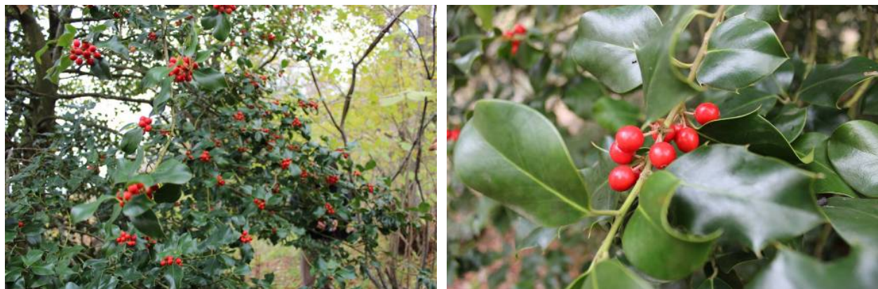
Figure 17. Ilex aquifolium L.

Adolescents in the residential areas near the basin rarely leave the bus at the correct Quercus sp. , Carpinus sp. , Paliurus and Ulmus sp. populations are outstanding. These small groups of trees, whether Thrace is a testament to the inner sections of the steppe area. Thrace region, as a result of the destruction of forests to make farmland, today has the appearance of steppe land. (Anthropogen step) In this section and in the valleys of the land base poplar and willow species are common (Figure 17).