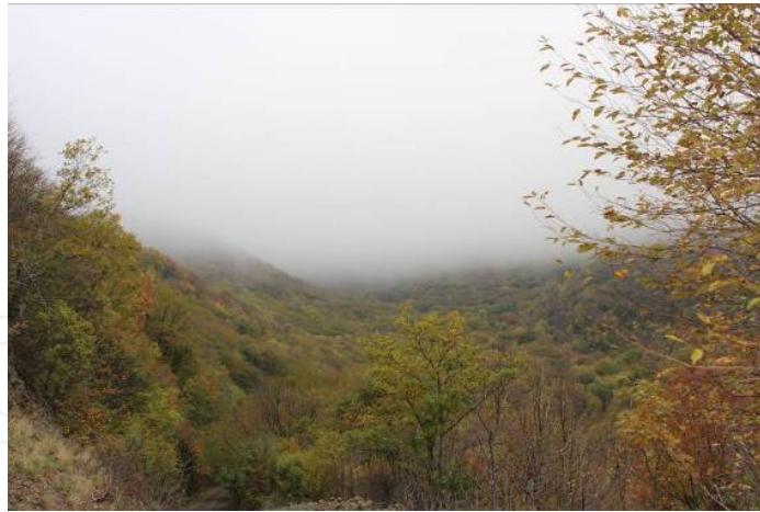
Figure 2. With a variety of important plant Ganos Mountain, Tekirdag, Turkey

The functional value is derived from the parts played by the species assemblages in supporting ecosystem processes and is expressed through the kinds of plant and animal assemblages occurring in various parts of the landscape on different soil types. In addressing this, matters requiring consideration include (Environmental Protection Authority, 2000):