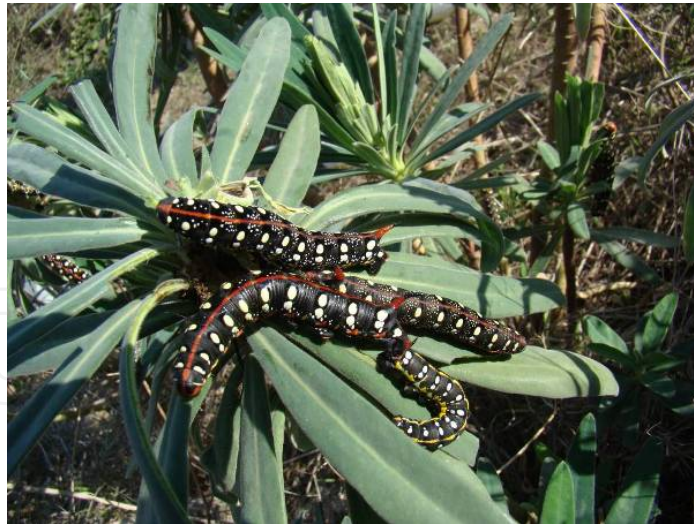
Figure 8. Larva fed on leaves of Euphorbia sp.