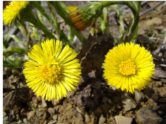
Figure 28. Tussilago farfara L..