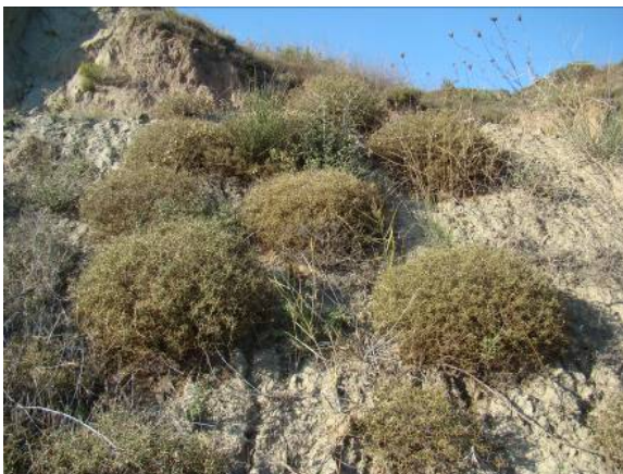
Figure 29. Sarcopoterium spinosum (L.) SPACH.