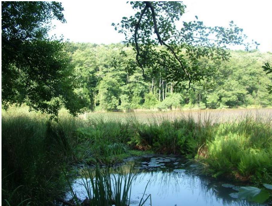
Figure 12. The Hamam Lake, İğneada, Kırklareli (the lake in forest)

Meadows and pastures in our country is one of the most important sources of biological diversity. These are considered one of the largest renewable native resources. Turkey, in terms of plants in the world, is one of the countries in the temperate climate zone. The main reasons for this wealth, climate differences, topographical diversity, geological and geomorphological diversity, sea, lake, river, such as various water variety of environments, ranging from 0-5000 meters height differences, three different combined with the fact that the place of plant geography, east and west of Anatolia differences between the present ecological and floristic diversity in all of these ecological reflection of the diversity (Figure 12).