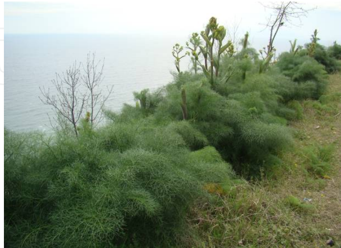
Figure 11. Ferula communis subsp. communis is used in pharmaceutical industry

components of biodiversity such as detritivores (organisms that break down organic matter) pollinators and parasites and predators of farm pests (Figure 11). For example the life cycle of some parasitic wasps and flies depend on nearby sources of food found in native vegetation. Some species of these parasites seldom travel more than 200 metres from such sources of food (Davidson and Davidson 1992).