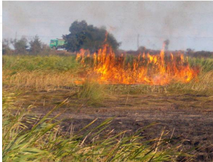
Figure 5. Applied to the wrong policies of nature conservation, local communities could lead to damage to the environment.