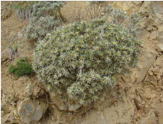
Figure 27. Thymelaea tartonraira L.