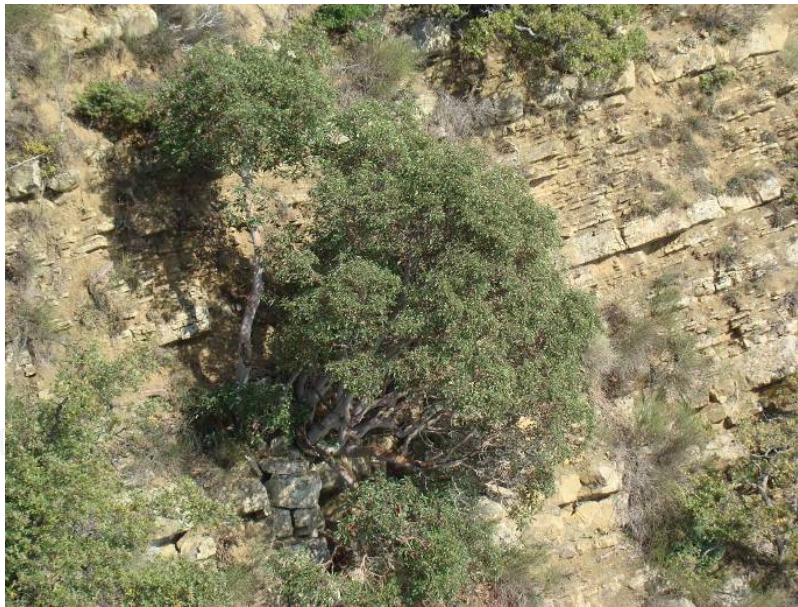
Figure 14. Arbutus andrachne L. (Southern slopes overlooking the sea), Ganos Mountains, Tekirdağ, Turkey

The native vegetation has taken over the operations supported by the complex structure of biological diversity reveals the cycle of a healthy ecosystem. For this reason, all of the physical and biotic factors in areas where native vegetation and an interaction of mutual. The native vegetation on the one hand living environments affected by factors other living and non-living, and their presence on the other hand constitute one of the most important