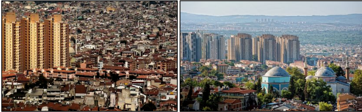
Figure 4. TOKİ housing projects in Bursa [41] (Left: 2 nd Prize Winner- Photo by Egemen Ergin, Right: Photo by Bülent Suberk).

“Ottoman” and “Seljuk” style architecture approaches in its projects will only be “characterless imitations” as long as TOKİ continues with projects which are unfamiliar with Anatolian culture in terms of site selection, organization of neighbourhoods, accommodation characteristics and social and cultural services.