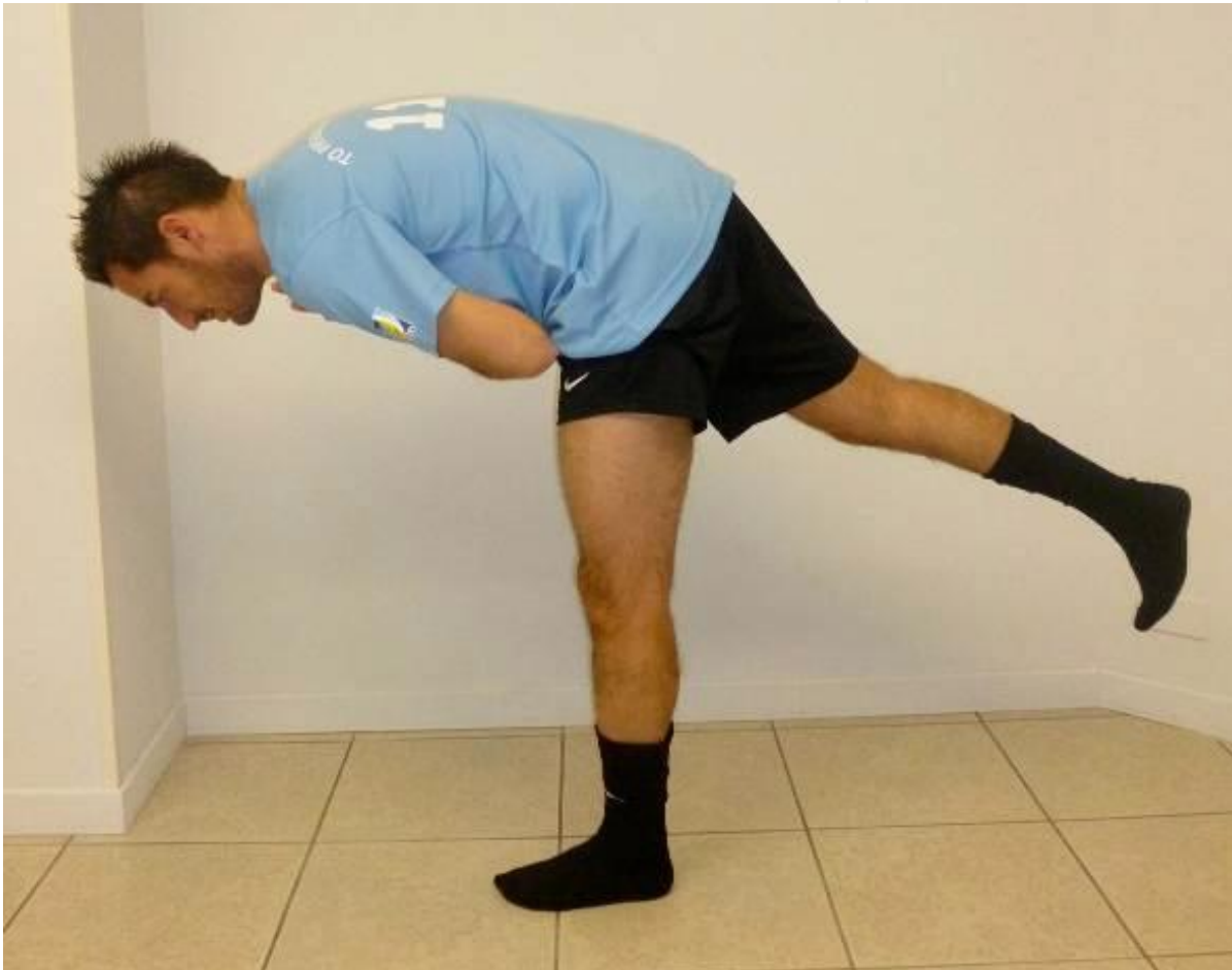
Figure 9. The patient is in an upright position on a single leg. Flexion of the trunk in all directions.