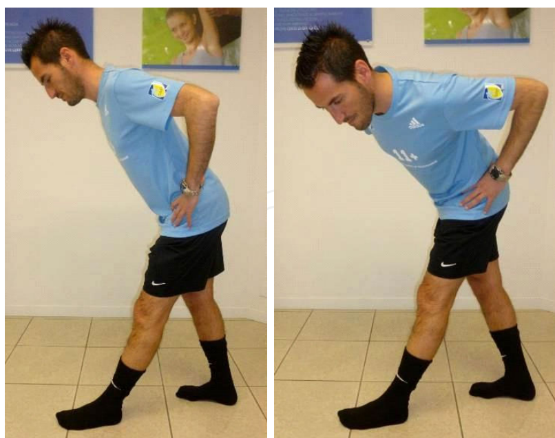
Figure 5. Walking hamstring stretch: the patient is in standing position. The injured limb is extended. Trunk flexion to stretch the hamstring muscles.