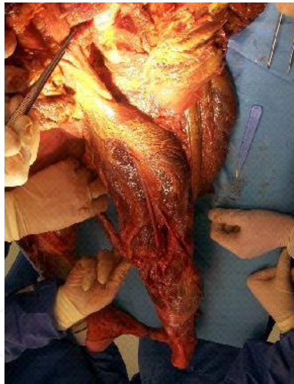
Figure 1. The cadaver anatomy hamstring

Possible signs of swelling and ecchymosis may arise a few days later the injury and consequently may not be noticed at the initial examination (Wood et al., 2008; Askling et al., 2006).