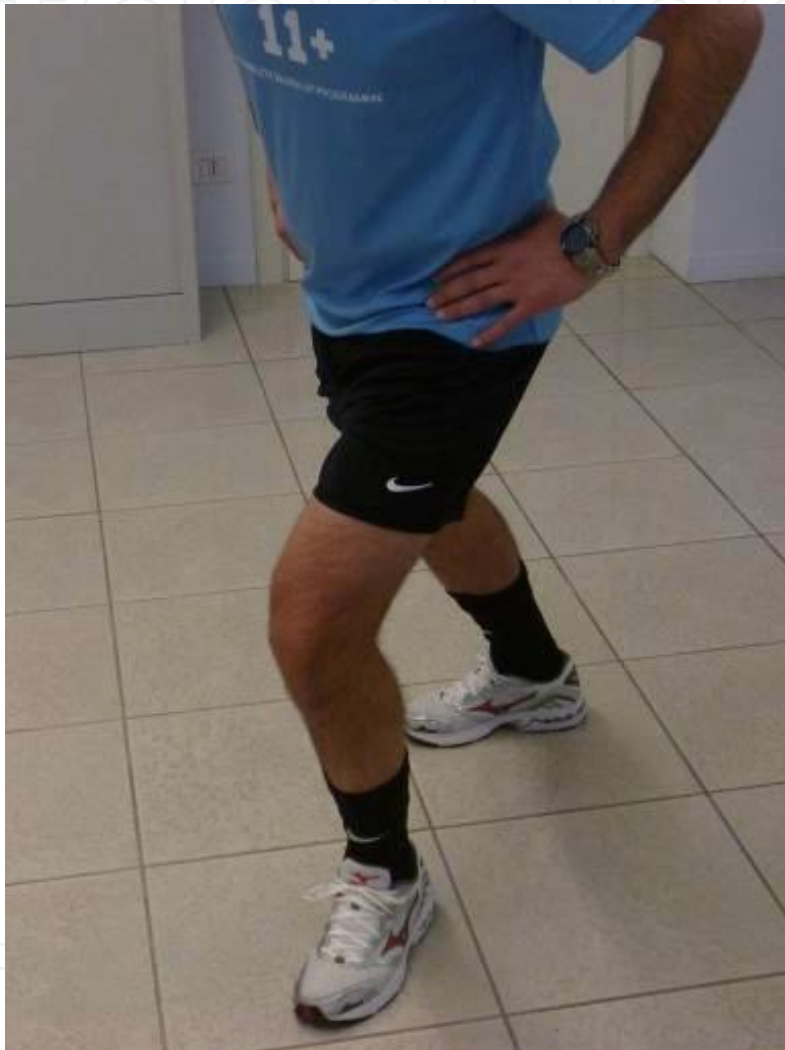
Figure 7. Lunges in all planes of motion. The patient is in standing position: must make small steps in all directions as to a change of direction.