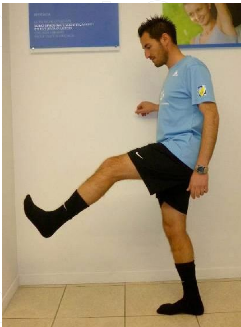
Figure 8. Foot catch exercise. The athlete stands parallel to a wall, and simulates the swing phase of walking at the first phase and after of the running. During the swing phase, the athlete performs a quick quadriceps contraction and then attempts to catch or stop the lower leg before reaching full knee extension by a hamstring contraction. In first phase with a little hip and knee extension. In a second phase increase hip and knee extension and the velocity.