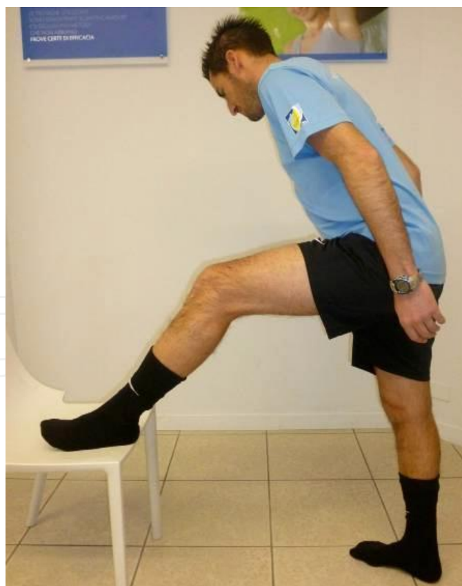
Figure 6. Hamstring stretch: swing phase position with slow side to side rotation and flexion extension of the knee.