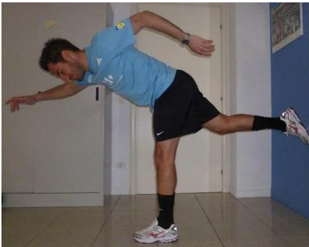
Figure 10. The patient is in an upright position on a single leg: flexion of the trunk with arms that push forward to increase the difficulty.