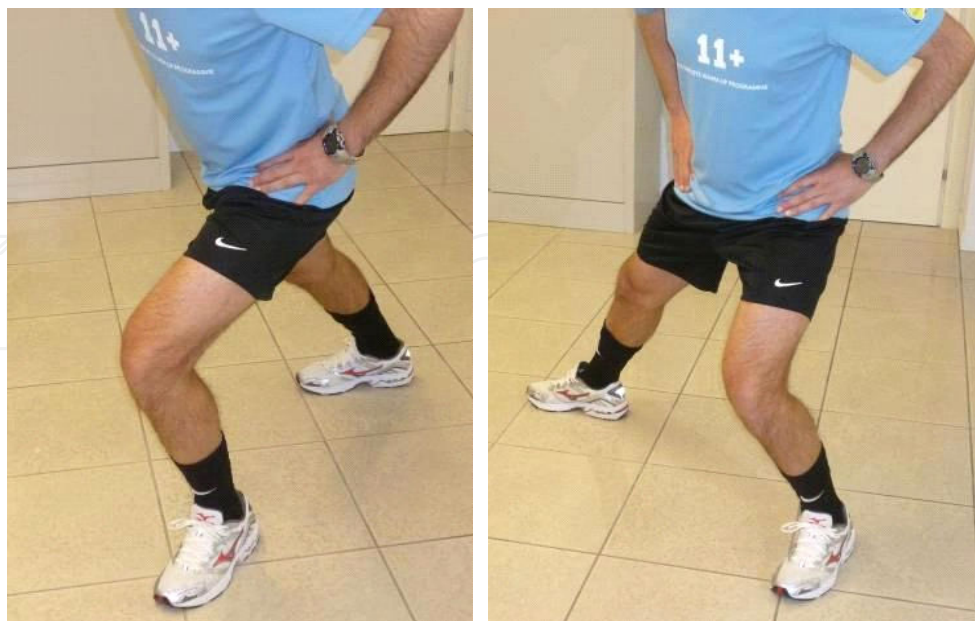
Figure 11. Lunges in all planes with return to start position. Increasing the length of the step and / or the execution speed of each sitting to vary the training stimulus.