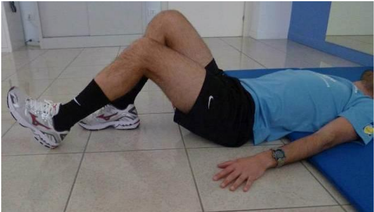
Figure 3. The patient is lying on the ground: submaximal to maximal isometric contractions at different knee angles. 5 sec of contraction 5 sec of rest for 6 times. 4 – 5 times / day.