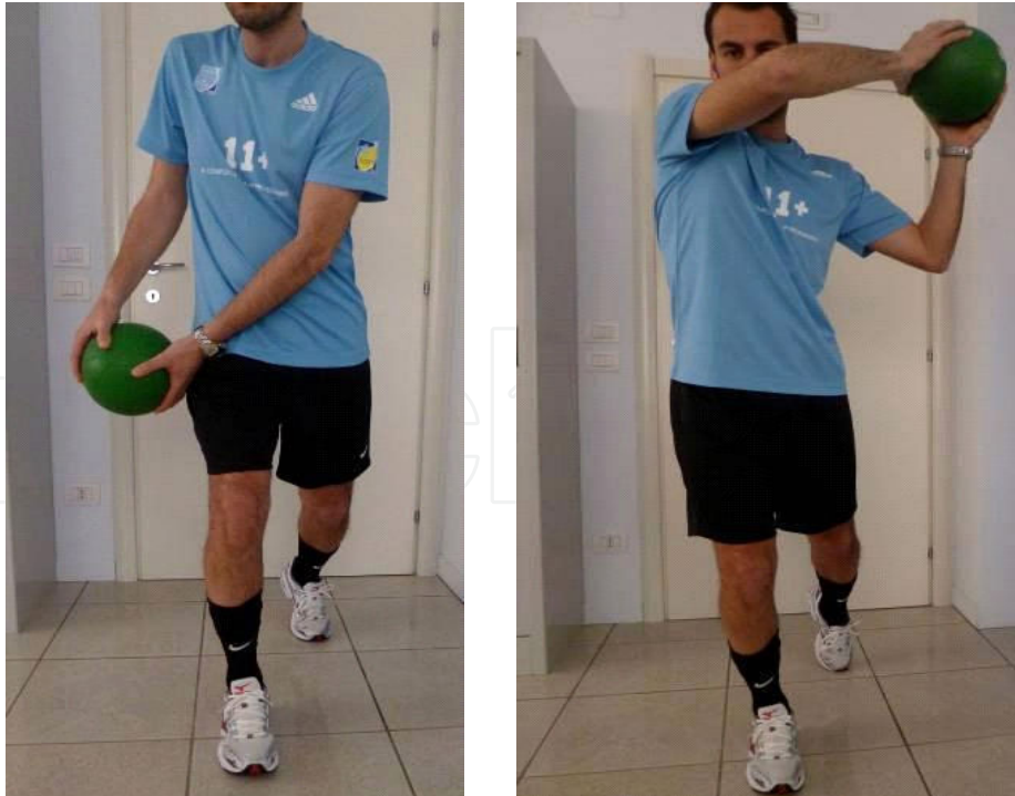
Figure 4. The patient should rotate the trunk as for kicking with the aim to train the core musculature.