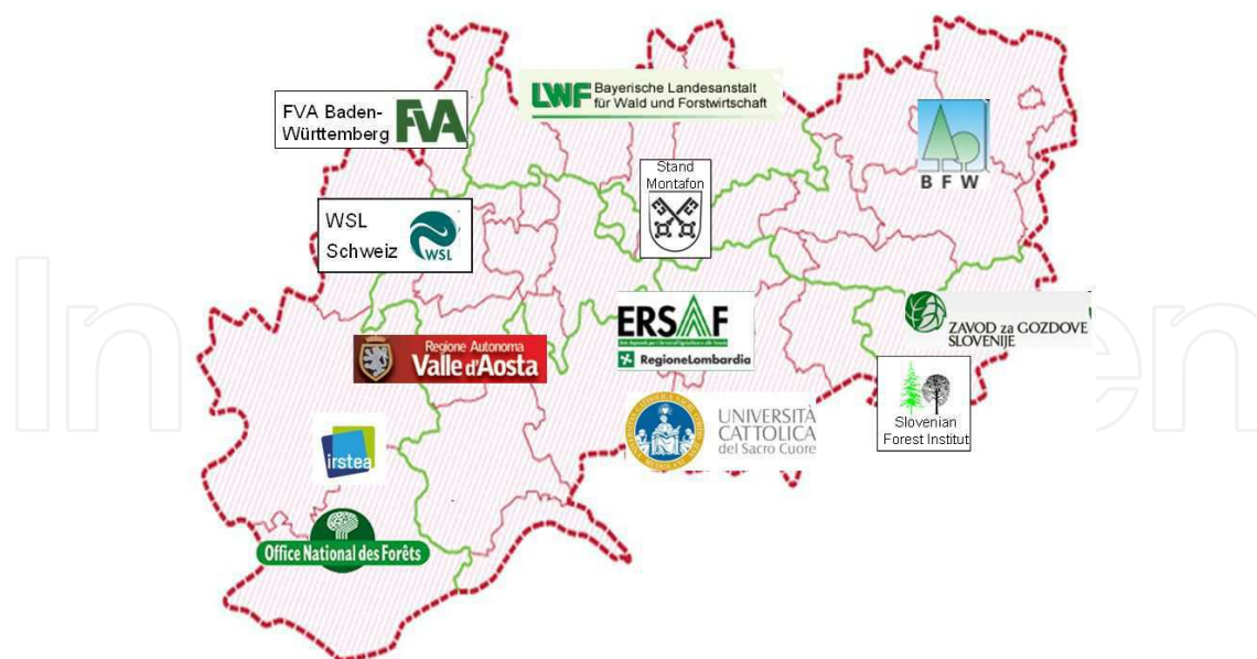
Figure 1. Geographical distribution of the partner institutions of the Interreg project "MANFRED - Management strategies to adapt Alpine Space forests to climate change risks".

The transnational case study Slovenia-Austria covers a region with physico-geographical similarities, that has been divided by politics in the past (sites Solčava-Lučé, Ossiacher Tauern, Dobrova in Figure 2). The regions have in common that timber production is the main target of forestry. Differences in the forest-management practice are visible. Slovenia has since long adopted the concept of continuous-cover forestry and is renown for its shelter-wood forests. In Austria, clear-cutting is still widely practiced within the regulations of the Austrian Forest Act. Presently, no severe challenges for practical forestry are identified, but the consequences of climate change on forests are only vaguely known [4]. In the case study area an intensive exchange of views and experiences was conducted.