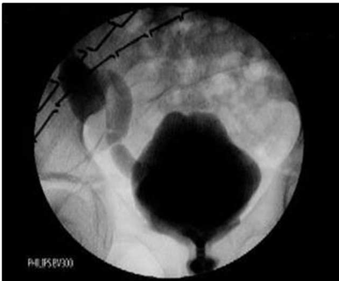
Figure 2. A 6-year old female child with spinning top urethra and right grade 4 VUR on VCUG.

febrile UTI, thickened bladder wall on ultrasound, children older than 5 years with day and nighttime incontinence, or children at puberty with persistent enuresis.