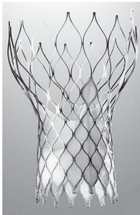
Figure 2. The CoreValve ReValving System