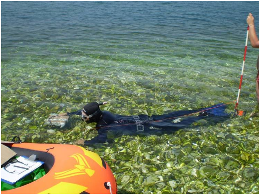
Figure 4. A moment of the localization operations