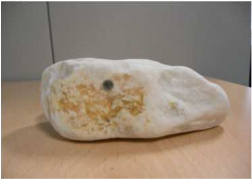
Figure 3. A Smart Pebble. On its surface is possible to notice the hole housing the transponder

The first experimentations on the Smart Pebble system were carried out in 2009 and this solution has been since then employed in several on-site applications on different beaches in Italy. The effective use of the system has roughly confirmed the results recorded in the laboratory tests: during the localization process, the transponders embedded inside the pebbles were localized even from distances higher than 50cm.