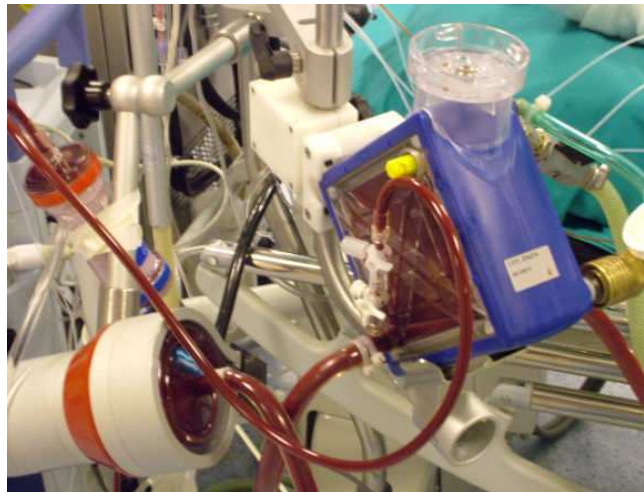
Figure 9. V-A ECMO circuit with polymethylpentene oxygenator (blue case)

Recently a new miniaturized system for V-A ECMO was introduced in the clinical practice. The system has the console directly connected with the oxygenator and the blood pump, which are integrated to each other. The console has a touch screen where is possible to monitor continuously several parameters such as hematocrit, hemoglobin, SVO 2 , resistance at the inlet and the outlet of oxygenator and the pressure drop (Figure 10).