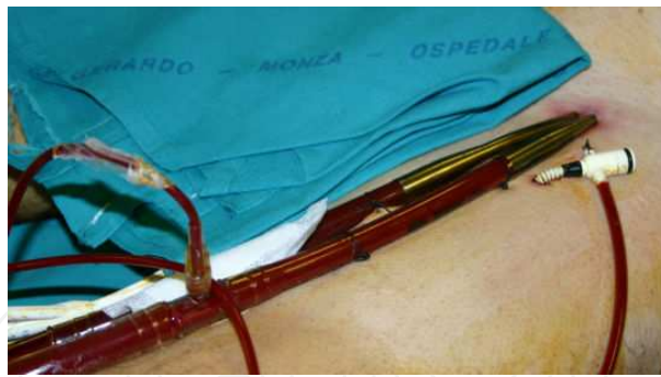
Figure 6. Distal leg perfusion to restore the blood flow.

Some Authors [25] suggested to insert a catheter for a distal perfusion if the mean pressure of the superficial femoral artery is lower than 50 mmHg.