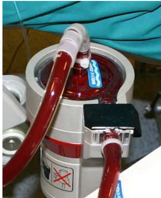
Figure 8. Centrifugal pump.

the pump head and this negative pressure pulls blood into the pump and then the blood is pushed towards the oxygenator.