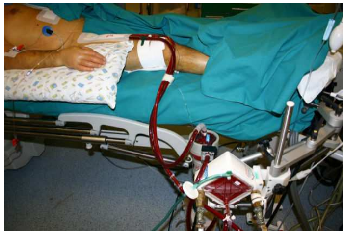
Figure 1. Patient supported with peripheral V-A ECMO

The veno-arterial ECMO configuration is a tubing loop with a venous arm connected to a venous cannula to allow the venous blood drainage and an arterial arm to return back the oxygenated blood inside the patient's circulatory system. This mode provides both cardiac and respiratory support and can be achieved by either peripheral or central cannulation (Figure1).