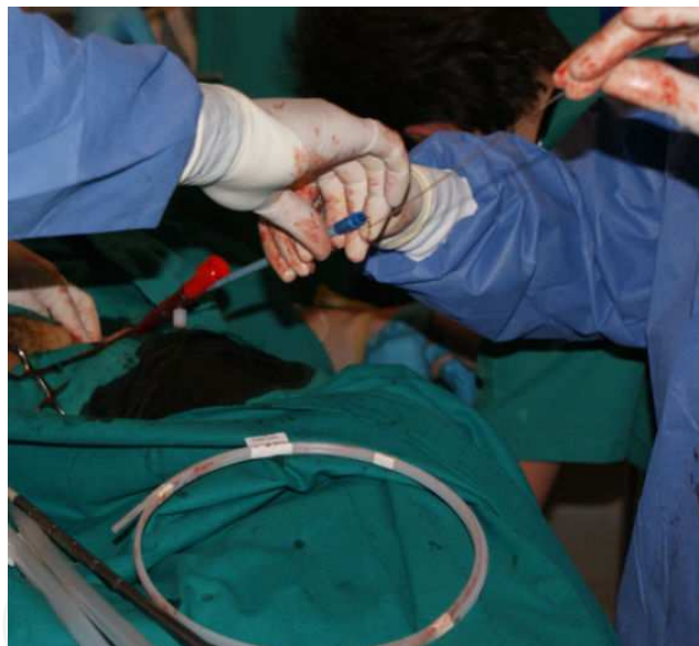
Figure 5. Percutaneous cannula insertion by Seldinger technique.

The size of the cannulas depends on the size of the patient; usually the arterial cannula ranges between 17 Fr to 21 Fr and the venous cannula ranges between 21 Fr and 25 Fr. Cannulas of sufficient size are required to support high blood flow with low resistance. Local complications, particularly at the site of peripheral insertion of VA-ECMO can occur, of which the most concerning is leg ischemia. For this reason all attempts the limb perfusion is restored, after noted the absence of anterior and posterior tibial artery flow, by inserting a 9-Fr catheter distally to the arterial cannula by means of vascular ultrasound scan as soon as possible after ECMO implantation (Figure 6).