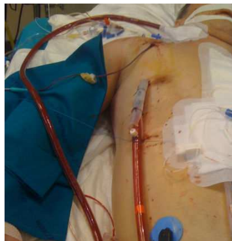
Figure 7. Cannulation of right axillary artery (tube on the right). Cannula is tunneled below the skin to protect by accidental trauma.

Alternative arterial approach, such as axillary arterial cannulation, has been reported [26] (Figure 7).