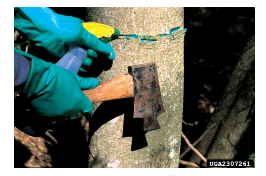
Figure 3. Hack and squirt application to larger diameter tree.

Stem injection applications are generally made to trees or shrubs with larger than 4 inch (20 cm) diameter trunk bases, which is the upper limit for effective basal treatments. In this type of application – also called hack and squirt, the herbicide is placed into a cut or frill made into the bark of the specimen (Figure 3). A hatchet, axe, machete, or other hand-held cutting device is used to make a downward cut/incision that penetrates the bark to the cambium layer, creating a cavity to contain a small amount of herbicide solution [147]. Although highly dependent on herbicide and species, incisions are made evenly around the trunk, or in the case of larger trees a complete girdle might be necessary. One rule of thumb is one incision per inch of trunk diameter [149]; another is no incisions more than 3 inches (10 cm) apart [150]. Herbicide activity on a given species is generally what dictates the number of cuts that is required. Additionally, it is useful to place these cuts near the base of the stem. Making the application higher on the stem will often increase the likelihood of stem-sprouting below the application site.