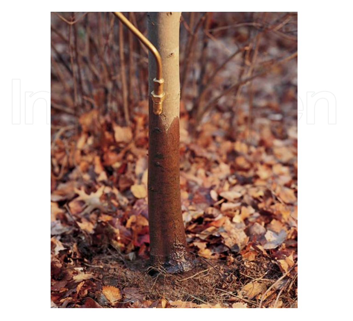
Figure 2. Basal bark application to small tree.

sapwood. There is little research as to the actual mechanism of mortality but is surmised that the herbicide is translocated slowly throughout the plant, accumulating in regions of active growth and killing meristematic tissues. The resiliency of many large woody trees and shrubs requires that the herbicide remain available within the plant, and presumably in translocatable form, for a period of time that allows the specimen to exhaust food reserves and/or meristems to provide complete control.