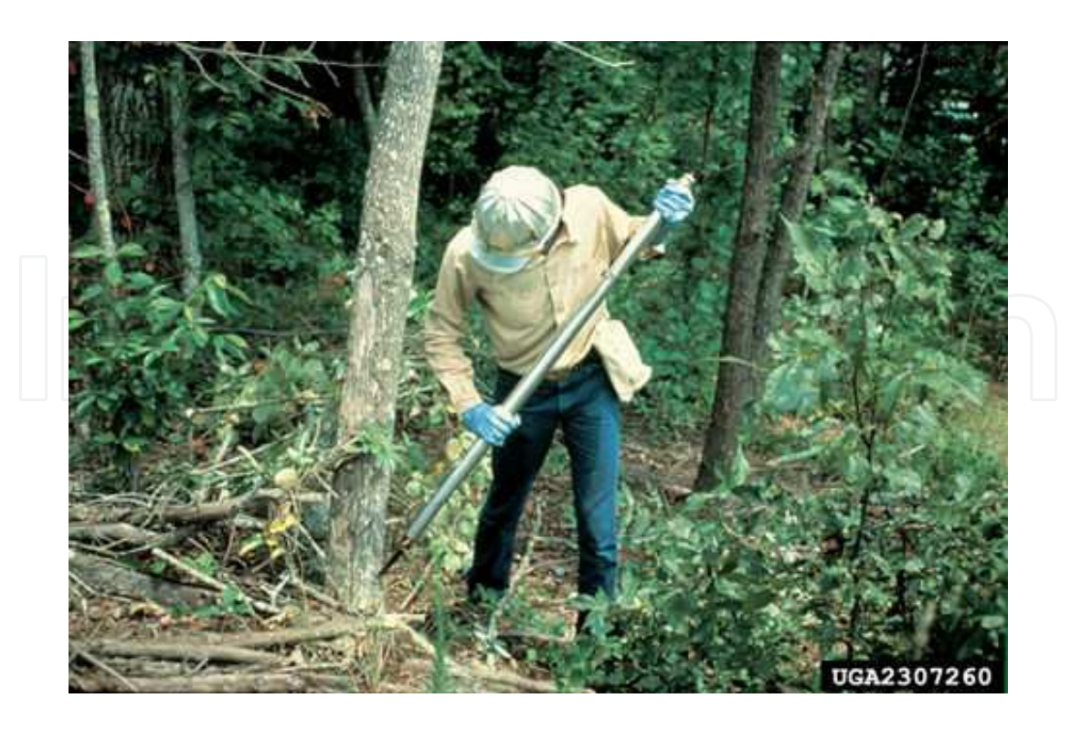
Figure 4. Stem injection of herbicide into trunk of target tree. Phot credit James Miller, U.S. Department of Agriculture, Forest Service, http://www.forestryimages.org

jabbed into a tree, and a lever is pulled allowing a pre-measured amount of liquid to flow through the end of the bar [147]. Some bar type devices will insert a granular pellet during each injection. Other injection tools include a hand-held gun, with a large diameter needle that can be inserted into softer perennial tissues, once again with a premeasured amount that is injected.