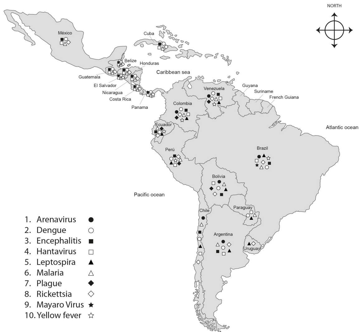
Figure 2. Distribution of several hemorrhagic fevers in Latin America

Symptoms and risk factors for dengue haemorrhagic fever (DHF) and severe dengue differ between children and adults, with co-morbidities and incidence in more elderly patients associated with greater risk of mortality. Treatment options for DF and DHF in adults, as for children, centre round fluid replacement (either orally or intravenously, depending on severity) and antipyretics. Further data are still needed on the optimal treatment of adult patients.