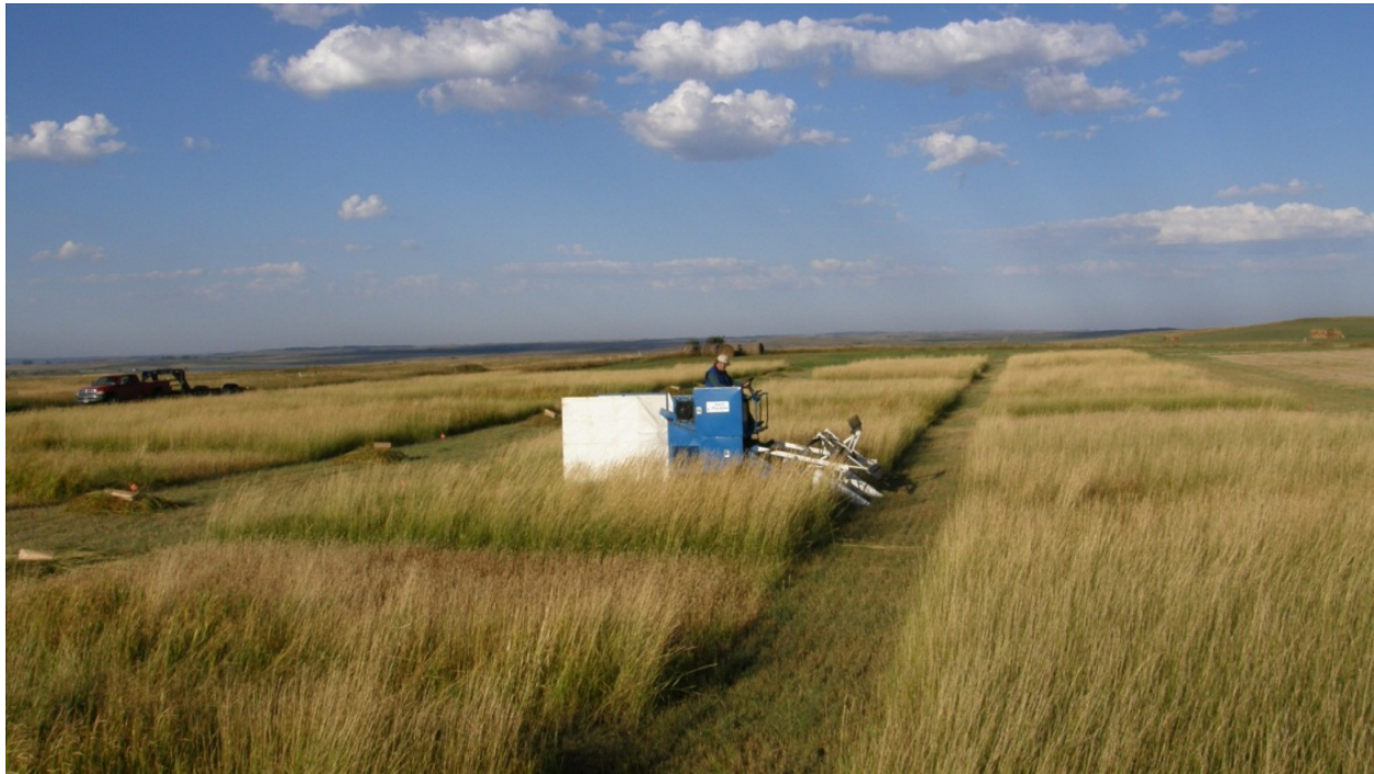
Harvesting perennial grasses plots in fall 2007, Streeter, ND.