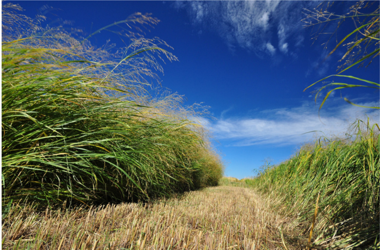
Switchgrass plot following the 2011 harvest at Central Grasslands Research Extension Center, Streeter, ND.

and there are no concerns about the invasiveness; (4) there are many environmental benefits for growing switchgrass.