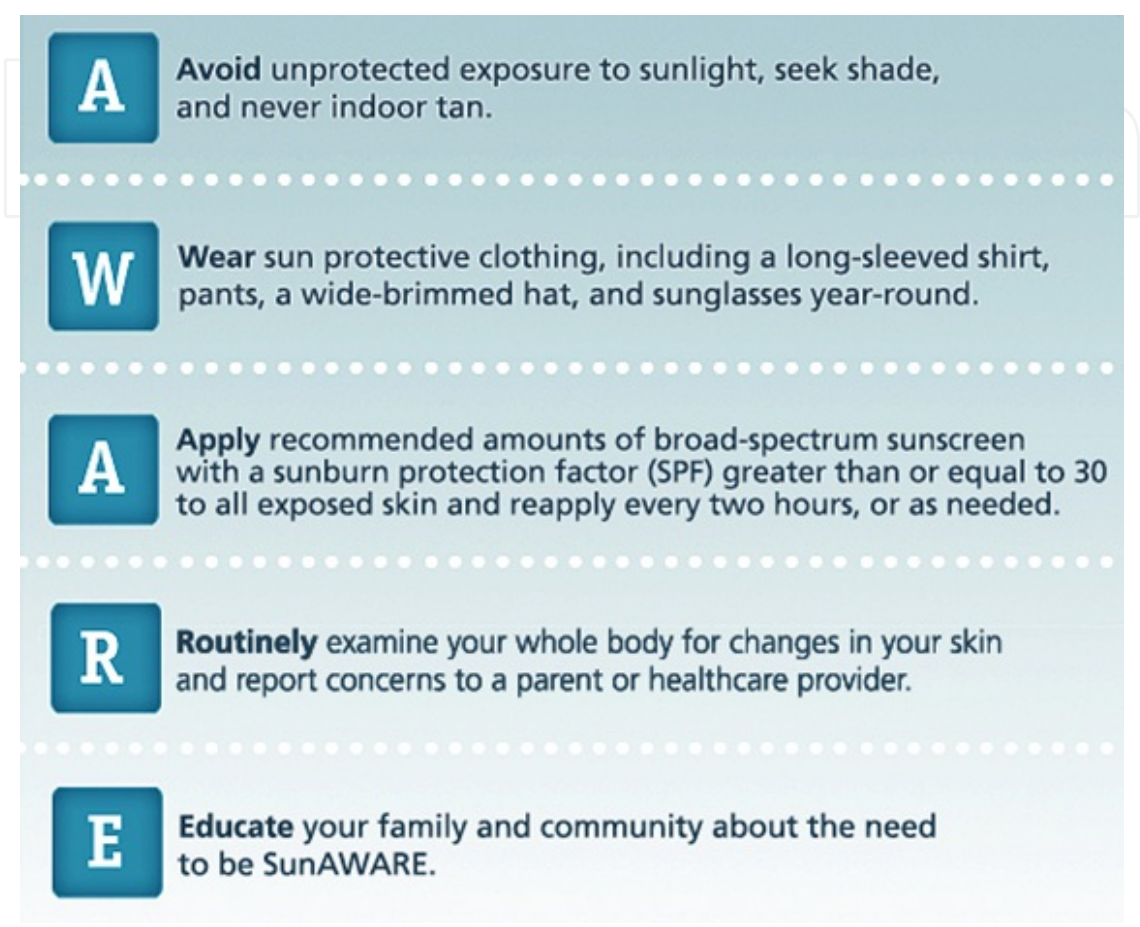
Figure 3. Sun protection advice displayed on SunAWARE website using the acronym AWARE. http://www.sunaware.org/be-sunaware/

awareness is encouraged by campaigns such as national “Don’t Fry Day” that takes place on the Friday before Memorial Day in the U.S. and is supported by the National Council on Skin Cancer and SunWise program [5, 51].