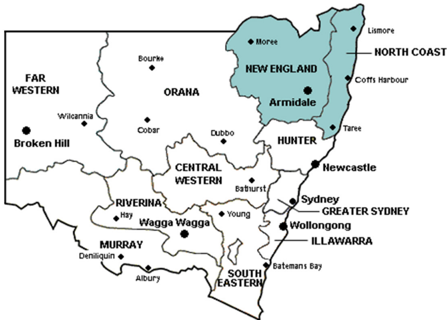
Figure 1. Tilbuster Commons was established close to Armidale, New South Wales, Australia.