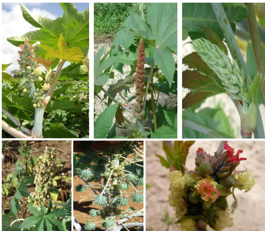
Figure 4. Arrangement of male and female flowers in racemes of castor: a) monoic normal; b and c) gynodioic; d) androdioic; e) interspersed; f) monoic bearing some perfect flowers.

among racemes can vary widely both within and among genotypes. It can also be influenced considerably by environment [27]