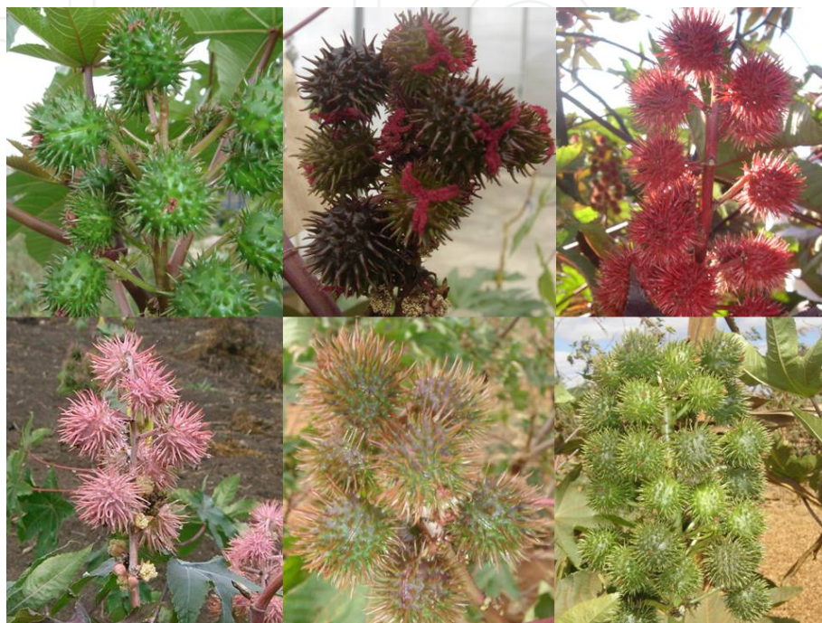
Figure 3. Examples of different colors in the fruits of castor bean.

(bloom wax), plant height (Figure 2), presence of spines on capsules (Figure 3), branching pattern, leaf shape, sex expression (Figure 4), seed color, and response to environmental conditions. Wide variation was observed in several morphological traits in the germplasm collections in India, USSR and elsewhere [14, 20, 15]. Also for quantitative traits its genetic polymorphism is exploitable in breeding programs [21, 22, 23, 24].