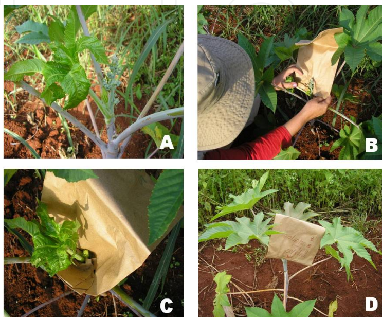
Figure 5. Self fertilization in castor. A) raceme with growing flowers; B) paper bag being placed over the raceme; C) Fixing paper bag; D) Identification.

it is necessary to isolate the area, physically (1000 meters) or temporally, or the use of self-fertilization using paper bags (Fig. 4). Both strategies are expensive. The self-fertilization is a hand labor and normally demands many people and time. is practically impossible to keep the distance recommended in areas multiplication of lines, where they are multiplied dozens of strains simultaneously because it would require a large extension of the area.