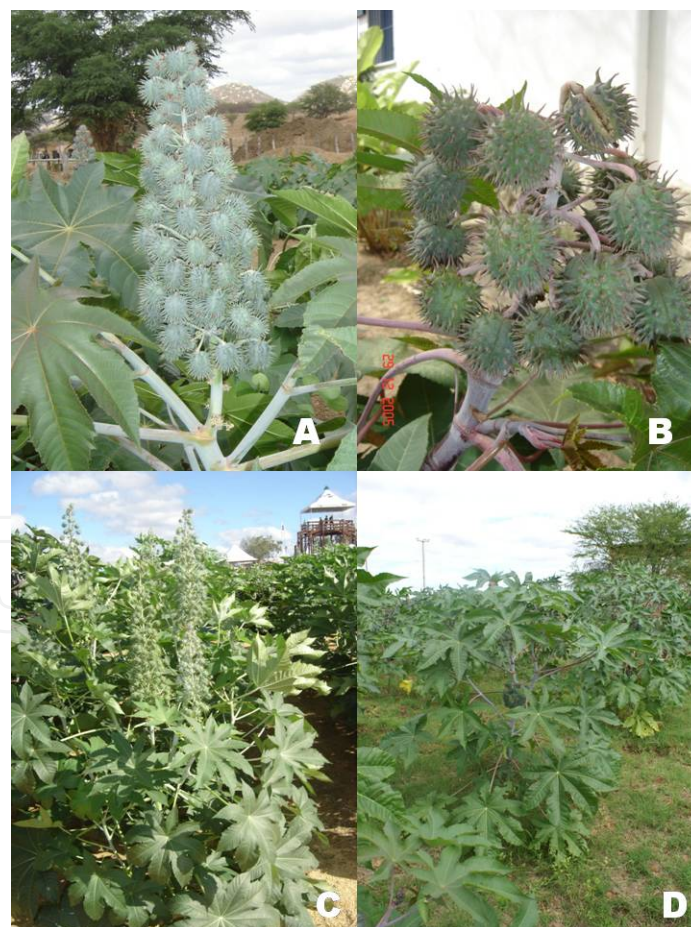
Figure 6. Embrapa´s castor cultivars: (A) BRS Nordestina, (B) BRS Paraguaçu, (C) BRS Energia, and (D) BRS Gabriela.

BRS Nordestina stands out from the average height of 1.90 m, greenish stems with the presence of wax, conical racemes, semi-dehiscent fruits, and black seeds. The period between emergence and first flowering raceme is 50 days, on average, while the average weight of 100 seeds is 68 g, and the oil seed content is 48%. The average yield is 1,500 kg/ha under conditions of normal rainfall in the Northeast semiarid region. The period between the emergence until the last harvest is 250 days. The BRS Paraguaçu has an average height of 1.60 m, purple wax stem, oval raceme, semi-dehiscent fruits and black seeds. The period from emergence to flowering is 54 days, while the average weight of 100 seeds is 71g, and the oil seed content is 47%. The average productivity is 1,500 kg/ha under rainfed conditions of the semiarid region of the Northeast. Earliness is a key feature of BRS Energia, whose average cycle is 120 days between emergence and maturation of the last racemes. The appearance of the first raceme occurs about 30 days after germination. The yield of this cultivar is 1.800kg/ha under the same climatic conditions of the others. The average plant height is 1.40 m, 100 seed weight is around 40 g