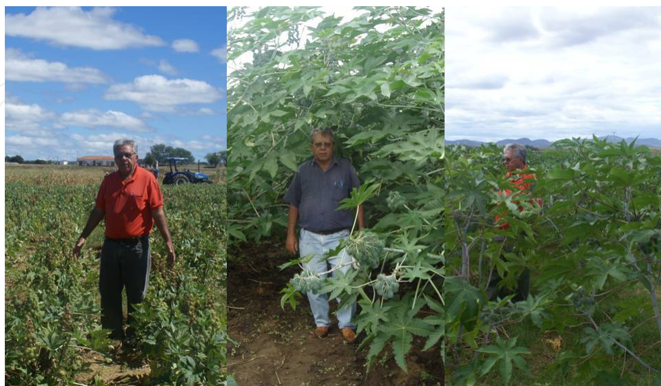
Figure 2. Examples of castor bean plants with different height.

A great variation in phenotypic expression is observed due to its cross-pollinated nature. Example of high variability in morphological characters are stem color, epicuticular wax