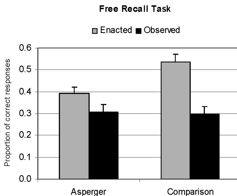
Figure 1. Mean of correctly recalled items of the Free Recall Task of actions (Enacted and Observed) in Asperger and Comparison groups: The bars represent means and the whiskers represent standard error (From Zalla et al., 2010).

The above findings are in accordance with a review of memory in ASD that pointed out a deficit in episodic memory, but are not in accordance to its assumption of preserved memory for non-social stimuli [65]. On the other hand, one must keep in mind that although there are deficits in encoding and organization of episodic and autobiographical memory in people with ASD, their storage and retrieval are preserved [66,67].