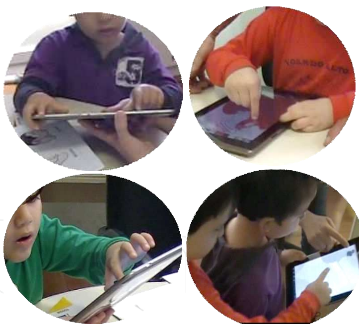
Figure 5. Using tablets with subjects with autism

With the use of tablets, we could notice attention spans increased for all the subjects. Speech was also prompted in all mediations. So, subjects' range of vocabulary has increased. Subject 1 showed easiness with the technology and the participation as an intentional agent in mediated actions. He is currently producing more words with two syllables and participating in scenes of joint attention in the mediations with other subjects.