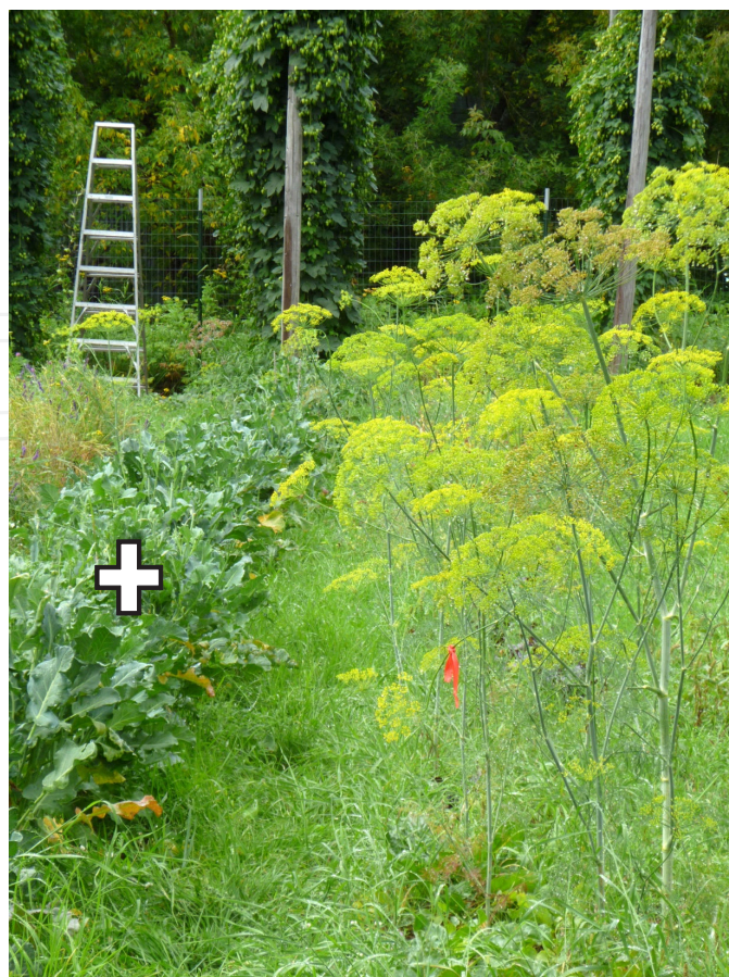
Figure 4. Dill (companion plant) is used as a physical barrier to protect broccoli (target crop) from pest attack. Here, the height of the dill can impede pest movement.