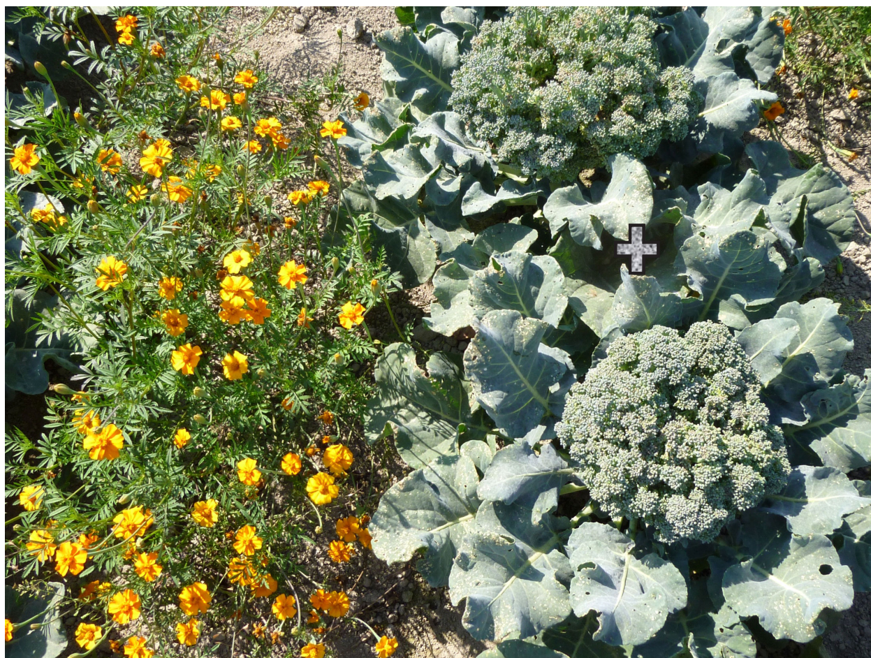
Figure 3. Marigolds (companion plant) are intercropped with broccoli (target crop) to interfere with host plant location. Here, several mechanisms may be involved in protecting broccoli including masking host plant odors or visually camouflaging broccoli making it less apparent. Here, the symbol (+) is shaded to represent a less apparent target crop-broccoli.

that in a wind tunnel, cabbage root fly move toward Brassica plants surrounded by clover just as much as Brassica plants grown in bare soil indicating that odors from clover did not mask those of the Brassica plants [75].