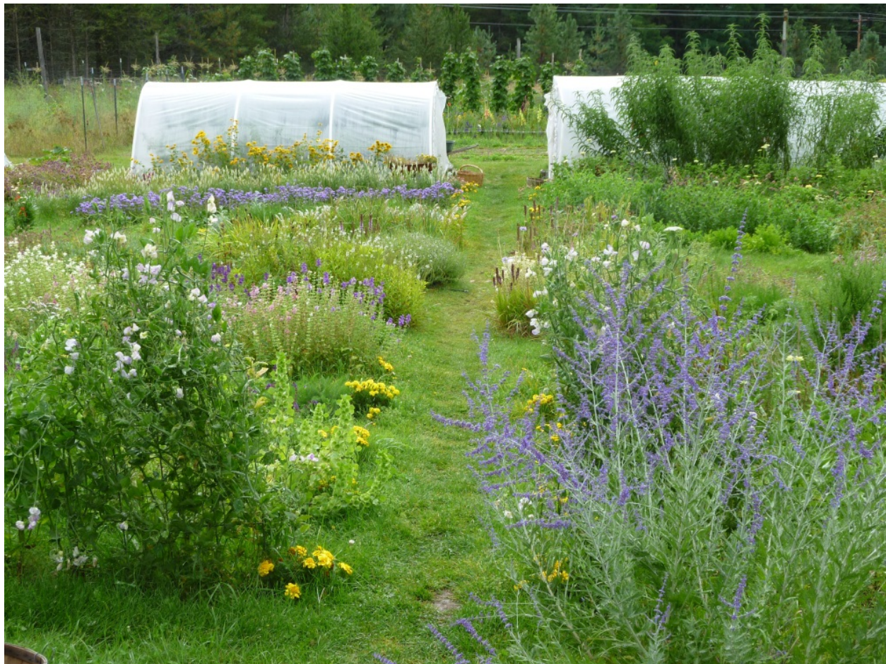
Figure 5. Flowering companion plants are incorporated into this mixed vegetable farm to enhance the efficacy of natural enemies and improve pest suppression.

Pest populations can be managed by enhancing the performance of locally existing communities of natural enemies [98]. This can be accomplished by incorporating non-crop vegetation, such as flowering plants also known as insectary plants, into a cropping system (Fig. 5).