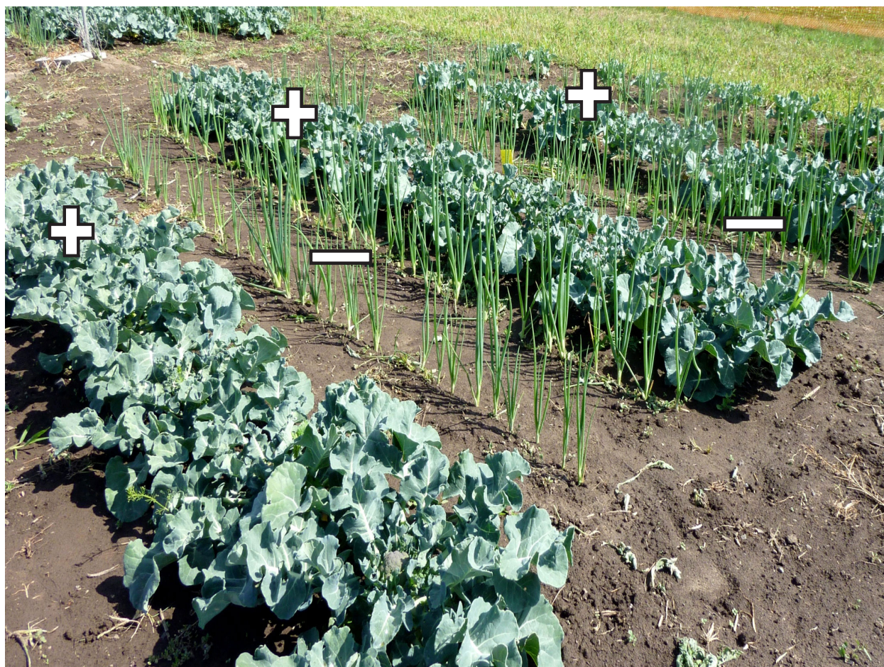
Figure 2. Intercroppings of spring onions (companion plant) are implemented to protect broccoli (target crop) from pest attack. Here, spring onions are used as a repellent to push pest insects away from broccoli. The symbols represent their potential attractive (+) and repellent (-) properties.

from herbs such as rosemary, eucalyptus, clove, thyme and mint have been used for pest control [48]. Generally, aromatic herbs and certain plants are recommended for their supposed repellent qualities. For example, herbs such as basil ( Ocimum basilicum L.) planted with tomatoes have been recorded to repel thrips [49] and tomato hornworms [50]. Plants in the genus Allium (onion) have been observed to exhibit repellent properties against a variety of insects and other arthropods including moths [51], cockroaches [52], mites [53] and aphids [54]. These examples represent a wide array of arthropods that respond to repellent odors and demonstrate the potential repellent plant properties can have on pest control.