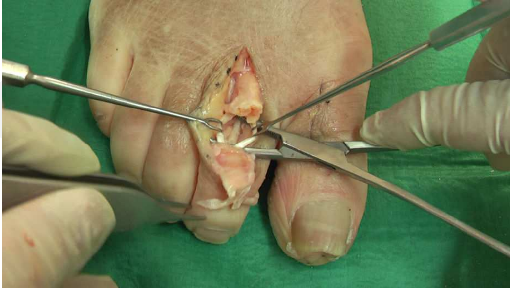
Figure 6. Medial and lateral hemitendon of the flexor digitorum brevis are retracted for plantar exposure of the flexor digitorum longus tendon.