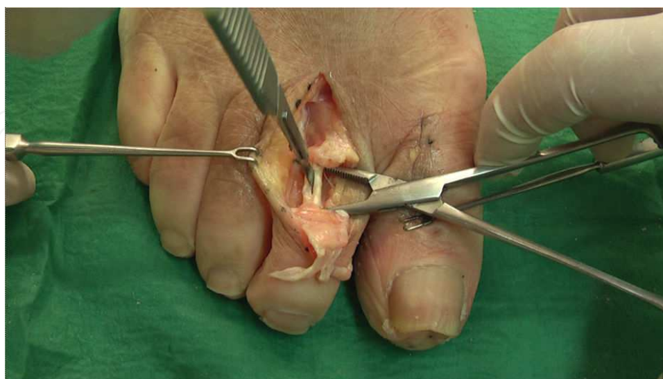
Figure 5. Flexor digitorum brevis is divided longitudinally and proximally using a blade #15 to permit passage of the flexor digitorum longus tendon.