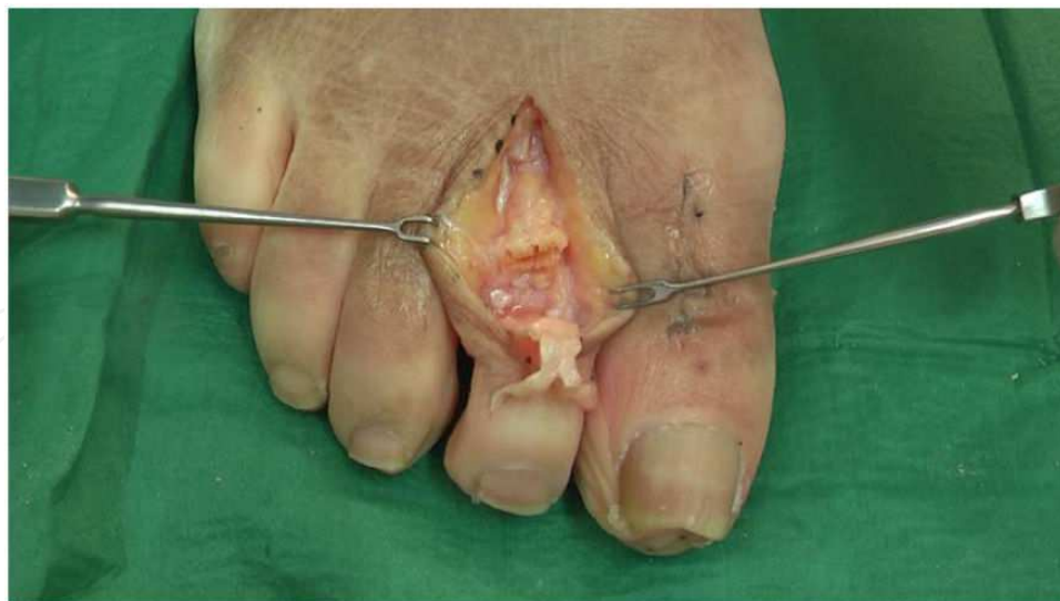
Figure 1. Dorsal aspect of the second digit after arthroplasty of the proximal phalanx and release of the metatarsophalangeal joint. The base of the middle phalanx is exposed. The proximal phalanx with the head resected is shown, and plantarly is the digital segment of the distal tendon sheath of the flexor digitorum longus and brevis tendons.