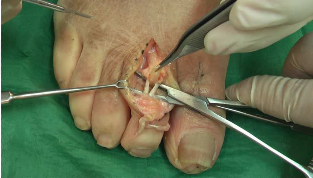
Figure 10. The stump of the proximal flexor digitorum longus tendon is clamped.