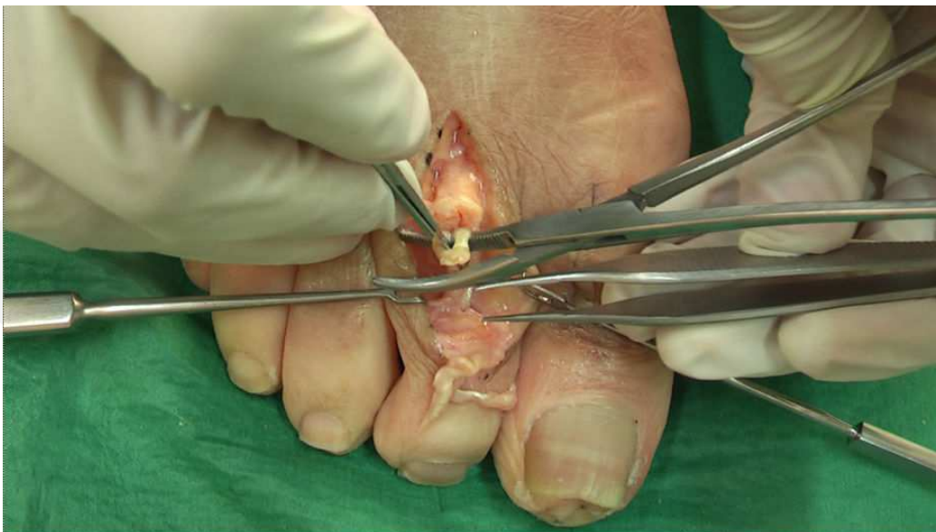
Figure 11. The long flexor is split longitudinally using a #15 blade.