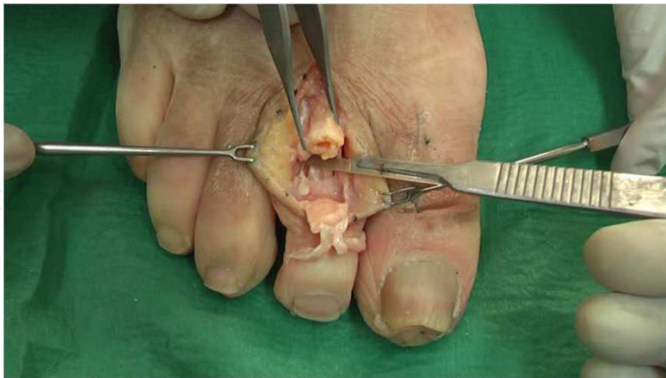
Figure 2. The plantar vincula are sectioned to release the flexor tendon sheath at the plantar aspect of the proximal phalanx of the second digit.