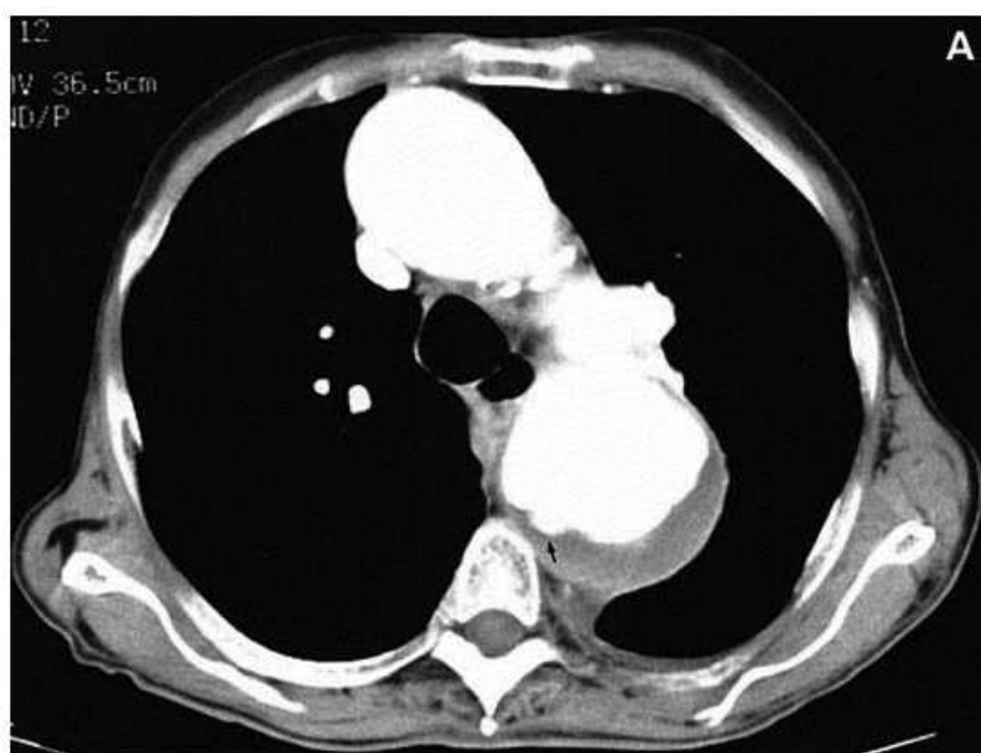
Figure 2. Computed tomography demonstrating a penetrating aortic ulcer as indicated by the black arrow (from Reference 18 – permission granted).

Although once considered the gold standard in diagnosis, angiography has fallen out of favor as the preferred diagnostic modality for acute aortic syndromes. Indeed, contrast-enhanced computed tomography and magnetic resonance imaging are currently the modalities most frequently employed for diagnosis of penetrating aortic ulcers. The typical radiological features of penetrating aortic ulcers appreciated by these modalities includes severe aortic atherosclerosis, aortic calcification, thickening or enhancement of the aortic wall, and a crater-like focal outpouching of the aortic wall (Figure 2) [16]. If associated with an intramural hematoma, inward displacement of the intima may be appreciated. Transesophageal echocardiography can also be used for diagnosis with a reported high sensitivity and specificity, although its invasive nature and need for a skilled operator are relative disadvantages.