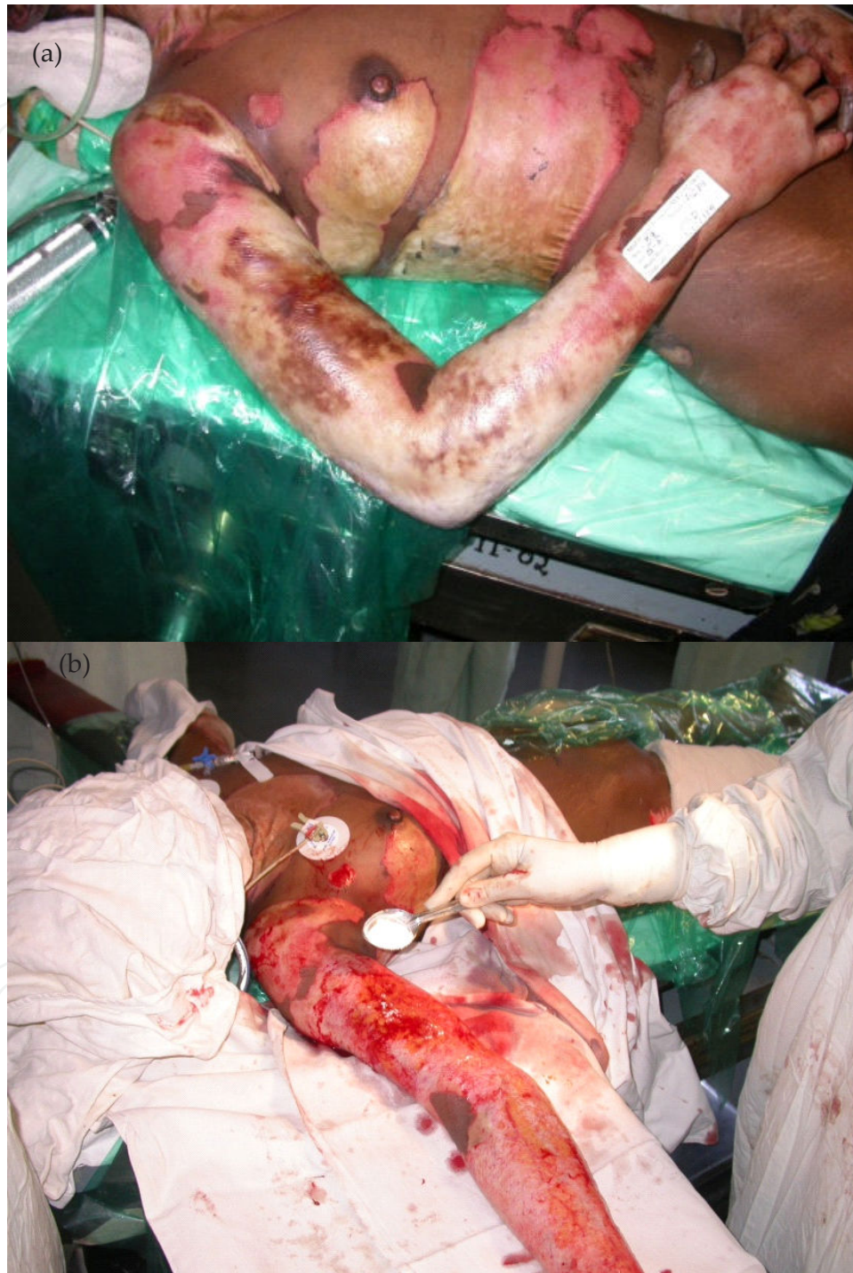
Figure 1. Showing Wound bed preparation. A : Burn wound before early excision; B: Sprinkling of Chloramphenicol powder after adequate excision of burn wound

The data was analyzed at the end of study period.