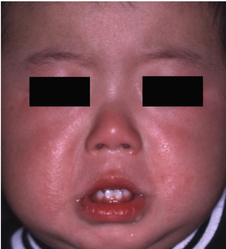
Figure 2. Clinical picture of a 1-year-old male baby with erythropoietic protoporphyria. Redness and swelling were seen on the face.