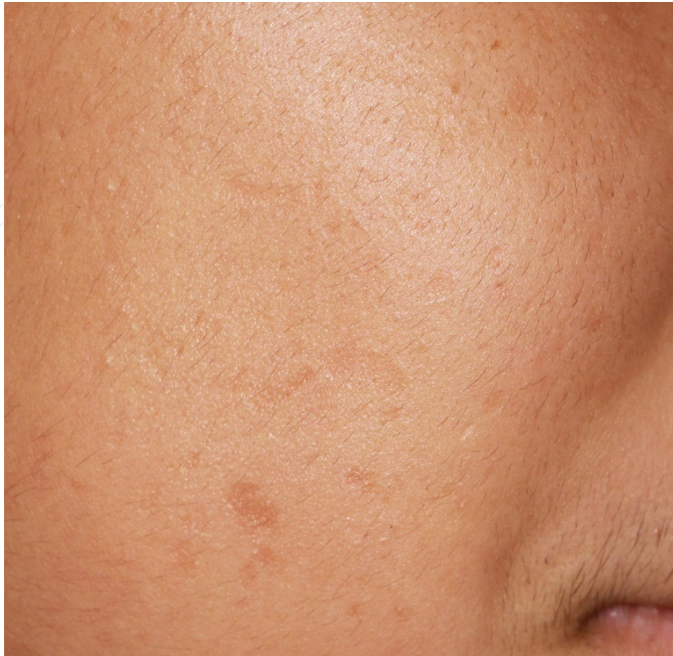
Figure 3. Clinical picture of a 14-year-old boy with erythropoietic protoporphyria. Depressed scars were seen on the face.

if sun exposure is not avoided, chronic lesions develop progressively with skin thickening (waxy lichenification on the dorsa of the hands) and scarring (pseudorhagades formation in the lips). 1