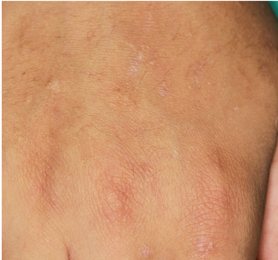
Figure 4. Clinical picture of a 14-year-old boy with erythropoietic protoporphyria. Whitish swelling scars were seen on the back of the hand.

25-hydroxyvitamin D. 7 Vitamin D deficiency was high in male patients and correlated with the severity of EPP. 7 Holme also reported that 17% was deficient and 63% was insufficient in serum 25-hydroxyvitamin D levels of 201 United Kingdom (UK) patients with EPP. 8 Then, we should care for vitamin D deficiency in EPP patients performing strict photoprotection.