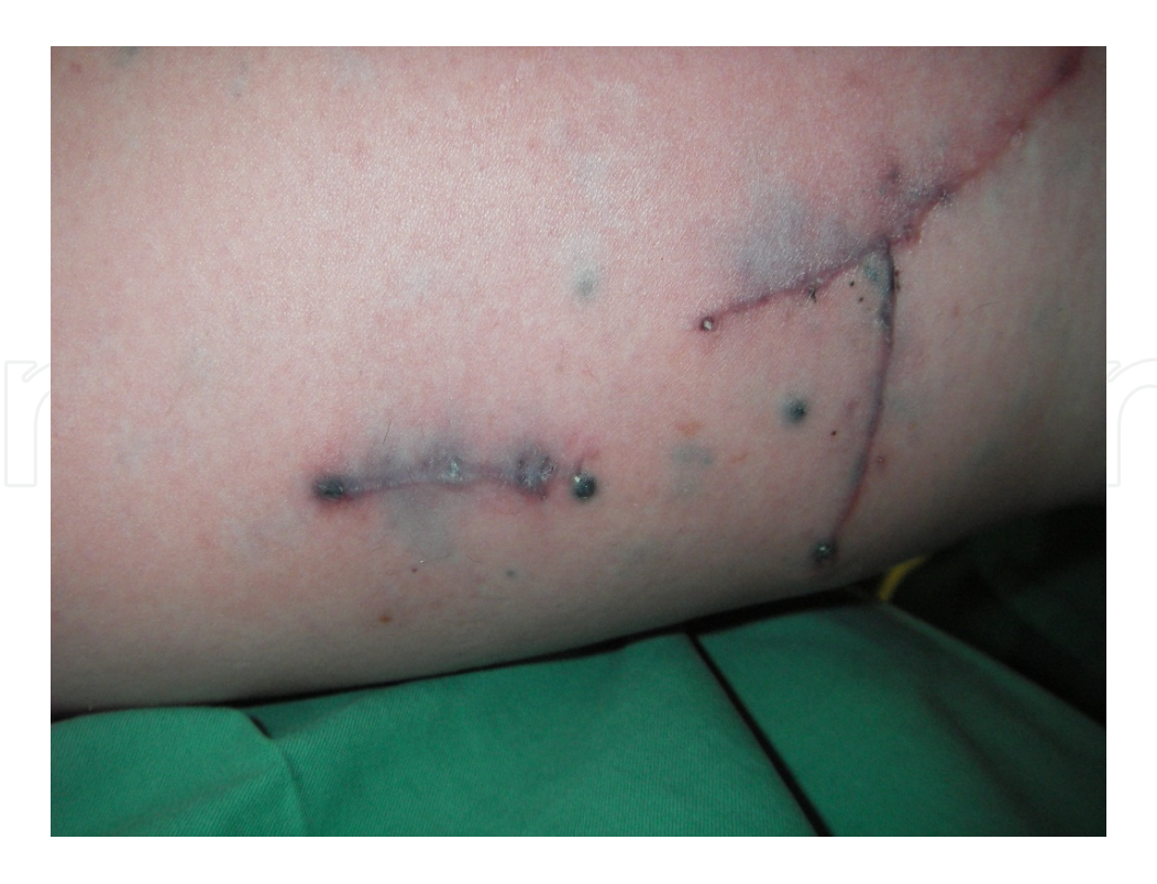
Figure 1. In-transit metastases on the left lower limb

Several therapies have been proposed for the management of in-transit metastasis including surgery, radiotherapy, and intra-lesional therapy. In-transit metastasis are sharply circumscribed with a clear line of demarcation from normal dermis and epidermis. This line does not contain any in-situ component. Therefore, wide excision margins are not recommended for these lesions and a complete macroscopic excision and primary closure is sufficient. If lesions are grouped closely together, an en bloc excision is acceptable [40].