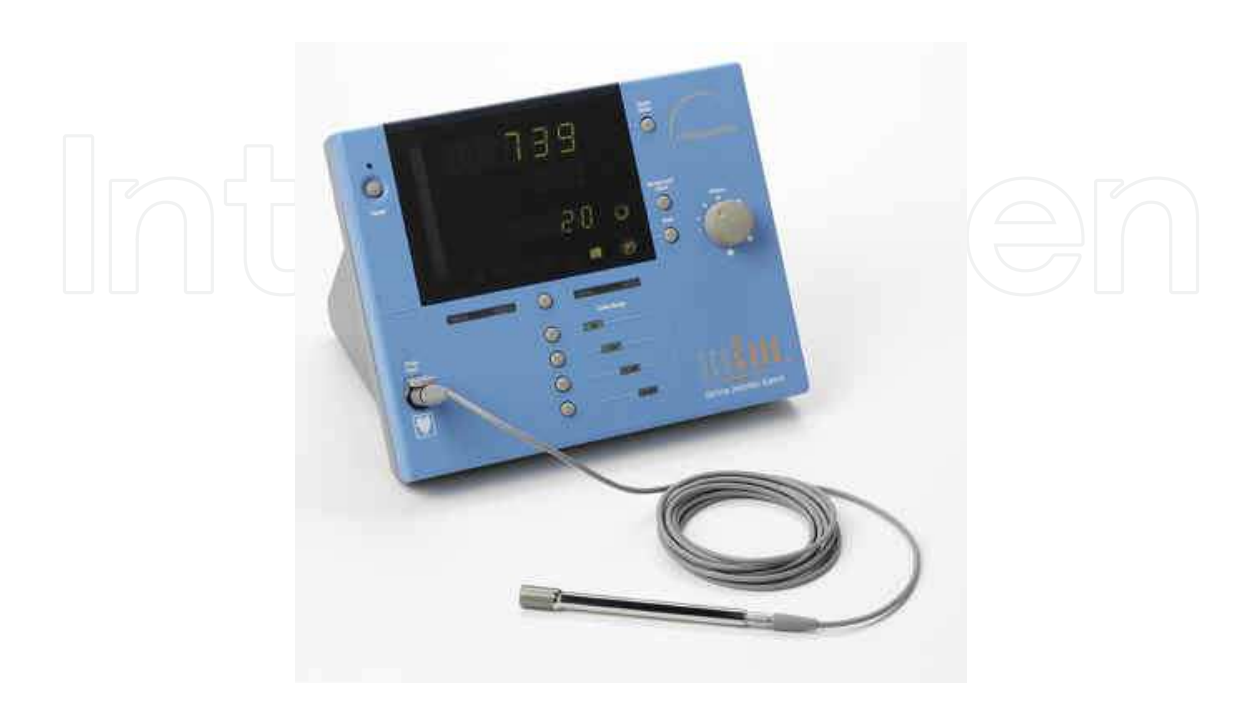
Figure 3. Gamma probe used to locate sentinel lymph node

survival for patients with positive SLN status was 72.3%, compared to 90.2% in those with negative SLN status [53].