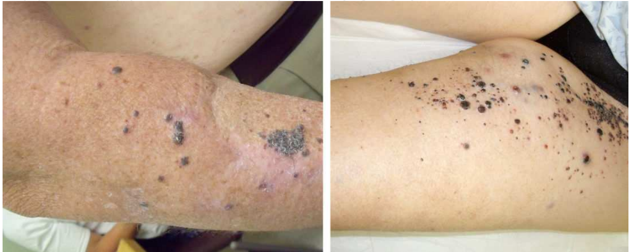
Figure 1. Examples of in-transit melanoma of the arm (left) and leg (right). Note the distribution and extent of disease, making these presentations very poor candidates for surgical excision. On the left, there is evidence of in-transit metastases both within the area of previous skin flap, as well as extending more proximally along its course of lymphatic drainage. On the right, there is extensive disease extending up to the inguinal crease.

the primary tumor and its lymphatic drainage basin. For non-extremity disease, the distribution can be even more variable, with widespread tumor burden on the head, neck or trunk, depending on the location of the primary melanoma.