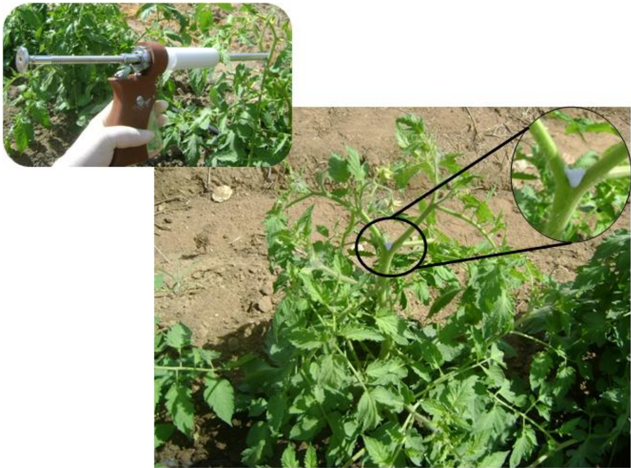
Figure 1. SPLAT NEO (containing Neoleucinodes elegantalis pheromone) on tomato crop in Bezerros, PE. At the top left, the applicator used.

Others technologies have also been used as the microencapsulated formulation. A fortnightly application of the sex pheromone using this technology in peach orchards prevented the chemical communication between the male and female of G. molesta , reducing male catch in traps baited with commercial pheromone. Thus, both the SPLAT® and the microencapsulated pheromone was effective to interrupt the chemical communication of G. molesta in peach orchards, even when this was associated with B. solubricola pheromone (Botton et al. 2005).