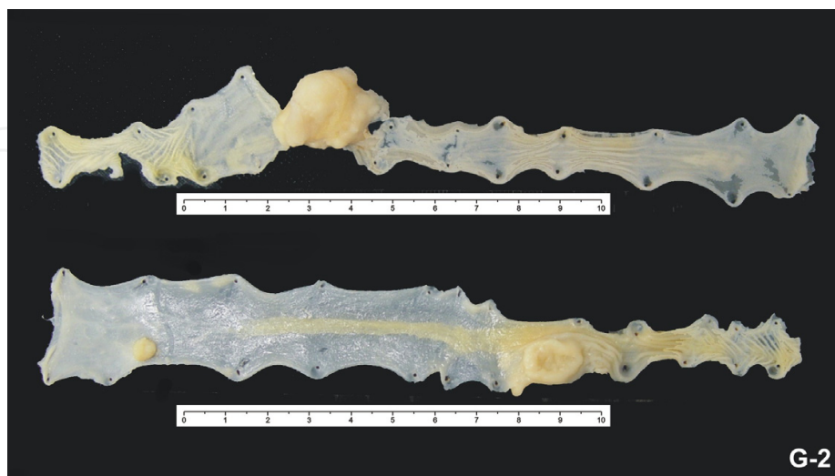
Figure 2. Topographic view of macroscopic growths by G2 – Induced with DMH. Sivieri et al [123]

days of the experiment, to determine the viable cell counts of total aerobic and anaerobic bacteria, Enterococcus spp., Enterobacteria, Lactobacillus spp., Clostridium spp., Bacteroides spp. and Bifidobacterium spp.