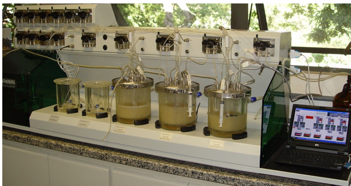
Figure 1. Computer controlled simulation of human microbial ecosystem (SHIME ®) housed in the Probiotics Research Laboratory of FCF/UNESP-Brazil. Sivieri et al.[53]

A major advance for in vitro fermentation systems was the development of continuous multi-stage models, which allow the simulation of horizontal processes. This type of system makes it easy to study the nutritional and physicochemical properties of intestinal microbiota, through the combination of three reactors connected in series, simulating the proximal, distal and transversal colon (see Figure 1). Later, Molly et al. [44] developed the human microbial ecosystem simulator (SHIME ®), which consists of a succession of five connected reactors, which represent the different parts of the human gastrointestinal tract with their respective values of pH, residence time and volumetric capacity (Figure 1). The five reactors are continually agitated and kept at a temperature of 37 °C by means of a thermostat. The medium is kept in the anaerobic state, by daily injection of N 2 . The appropriate pH for each portion of the GI tract is controlled automatically by adding 1N NaOH or concentrated HCl [44, 45].