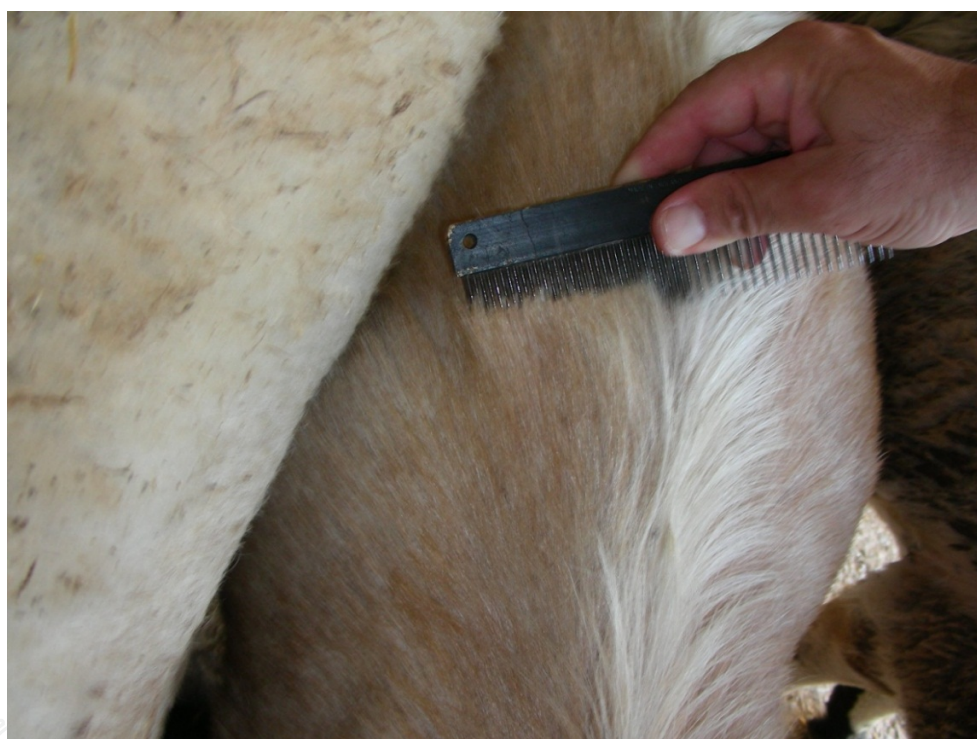
Figure 4. The presence of fleas was inspected using a comb

Animals within each farm were randomly inspected and fleas, if present, were counted every week for a minimum period of one month (Figure 4). Controls, untreated animals, were not used (accepted by the WAAVP guidelines) for both ethical reasons and because the aim of the study was to eliminate fleas from the farm premises. Practically no fleas were found during the post-treatment period. In more details, the mean ( \pm sd) number of fleas before and after the Deltamethrin treatment were 104.5 ( \pm 12.6) and 3.6 ( \pm 2.3 fleas), respectively. The overall success of flea control was >96.6%. The main flea species identified was Ctenocephalides felis , which is known to be very common and widespread. These results offer a sustainable approach to flea control in Greece due to the long protection period and if combined with hygienic treatment of the farm premises, may contribute significantly to flea control.