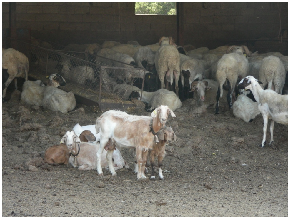
Figure 3. A typical farm environment favouring flea reproduction