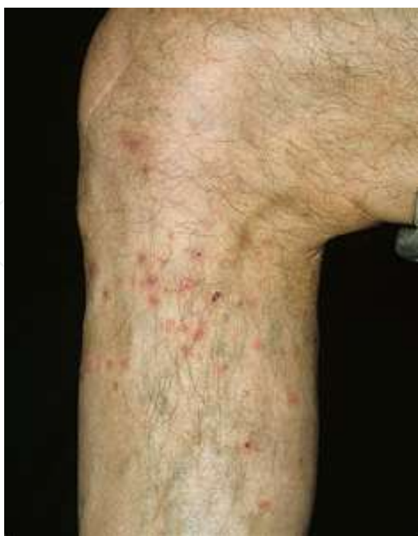
Figure 2. Reaction on human leg after flea feeding