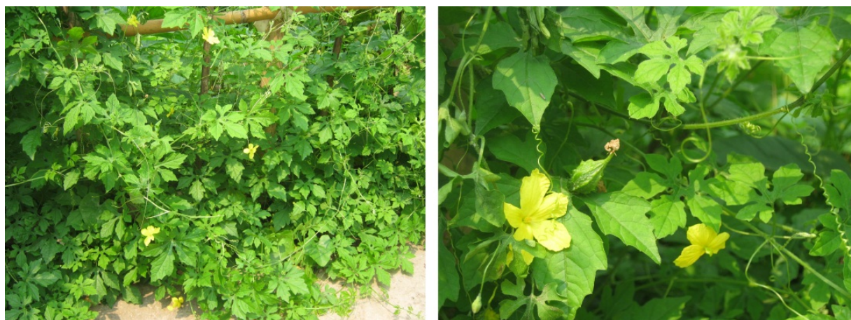
Figure 1. Flowers, immature fruit and young leaves of Momordica charantia (MC) at a home garden in Chiang Mai, Thailand (the picture was taken in March, 2012).

MC is an herbaceous, tendril-bearing vine growing up to 5 m in length. It bears simple, alternate leaves, with 3-7 deeply separated lobes. Each plant bears separate yellow male and female flowers [12]. Fruit 2.5-25 cm long, oblong, pendulous, fusiform, usually pointed or beaked, ribbed and bearing numerous triangular tubercles, 3 valves are present at the apex when mature. MC are perennial climbers cultivated throughout India and in Southern China and is now found naturalized in almost all tropical and subtropical regions. It is an important vegetable in India, Sri Lanka, Vietnam, Thailand, Malaysia, the Philippines and Southern China. It is also cultivated on a small scale in tropical America. MC is grown mainly for the production of immature fruit, although the young leaves are edible as a vegetable [3]. The young fruit is emerald green, but turns to orange-yellow when ripe. At maturity, the fruit splits into irregular valves that curl backwards and release numerous brown or white seeds encased in scarlet arils (Figure 1). All parts of the plant, including the fruit, taste bitter. It has been used extensively in traditional medicine as a remedy for diabetes.