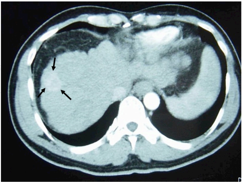
Figure 2. Computer tomography image showing a very cirrhotic liver with HCC